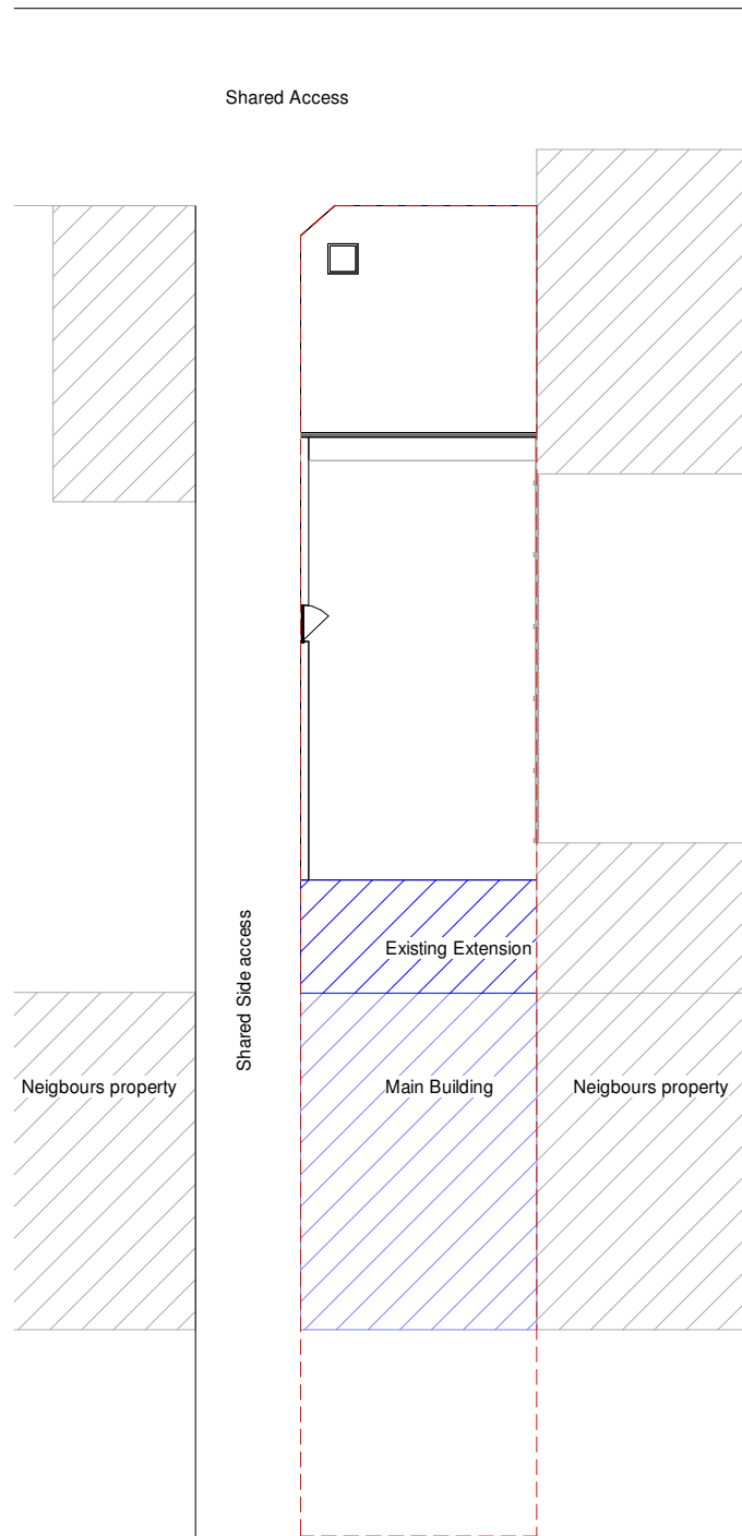
Proposed Block Plan 1 : 200