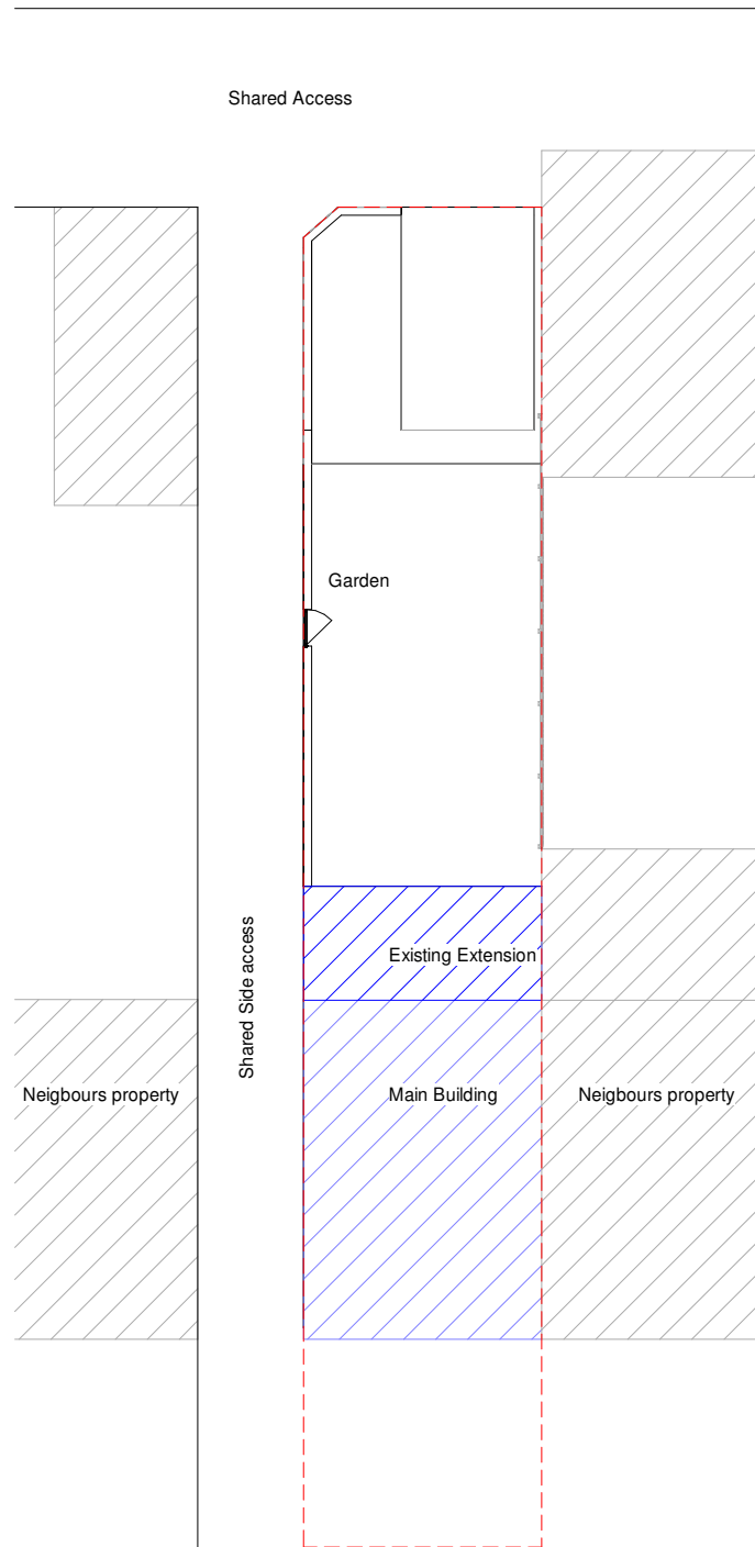
Existing Block Plan 1 : 200