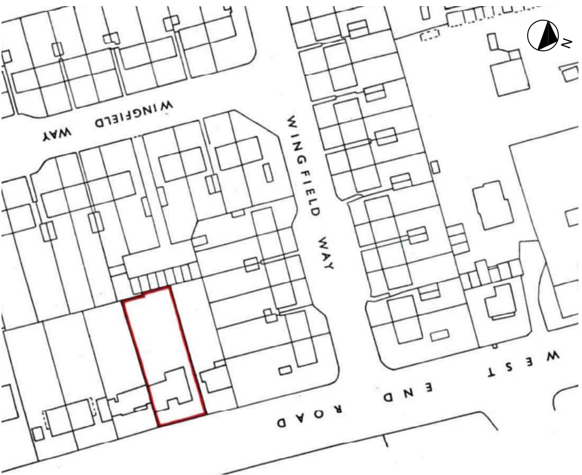
SITE LOCATION PLAN SCALE 1:1250 @ A3