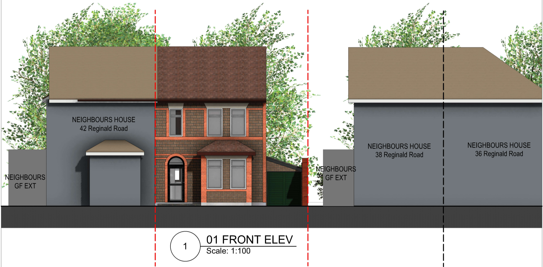
1 01 FRONT ELEV Scale: 1:100