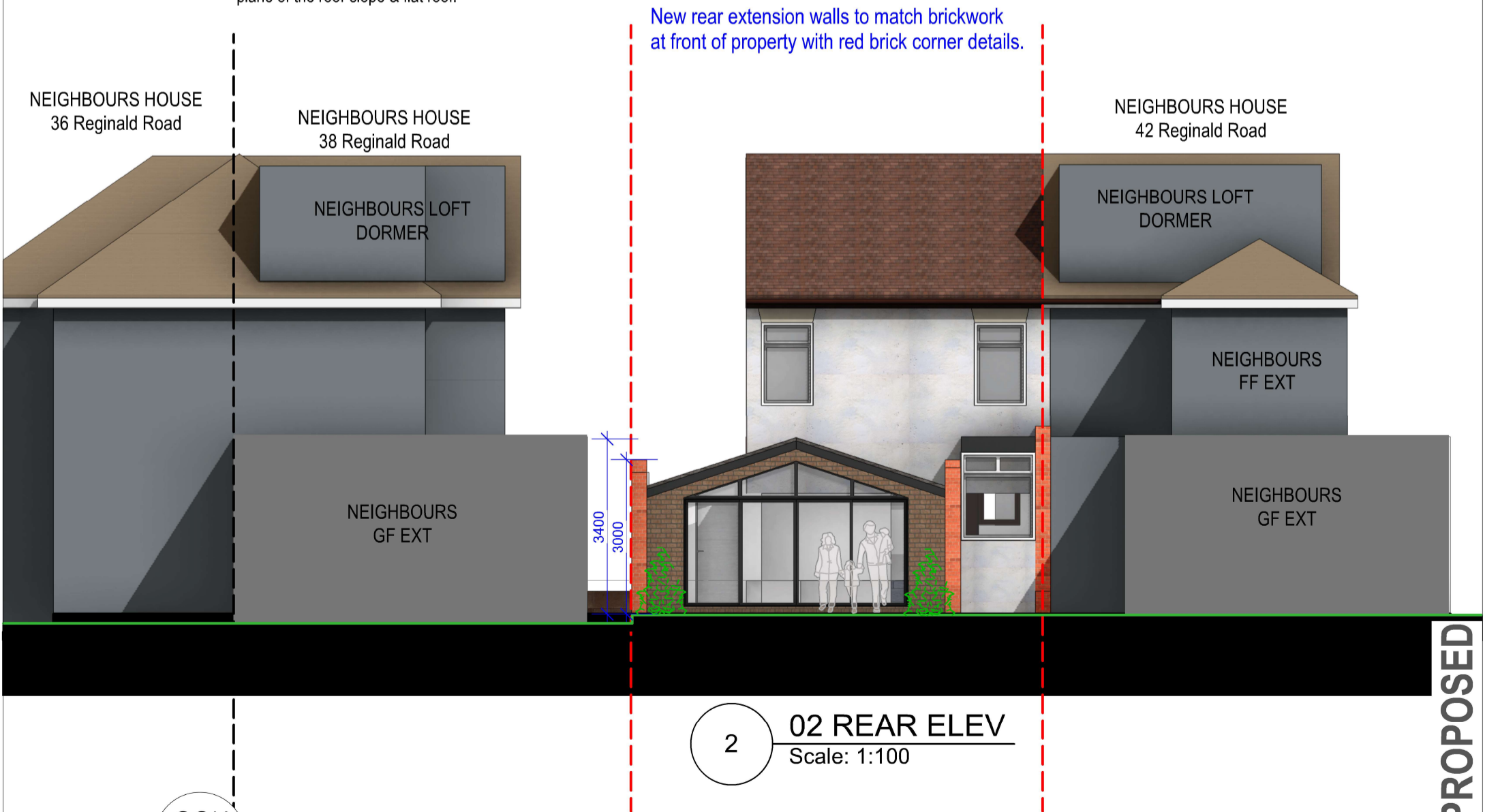
2 02 REAR ELEV Scale: 1:100