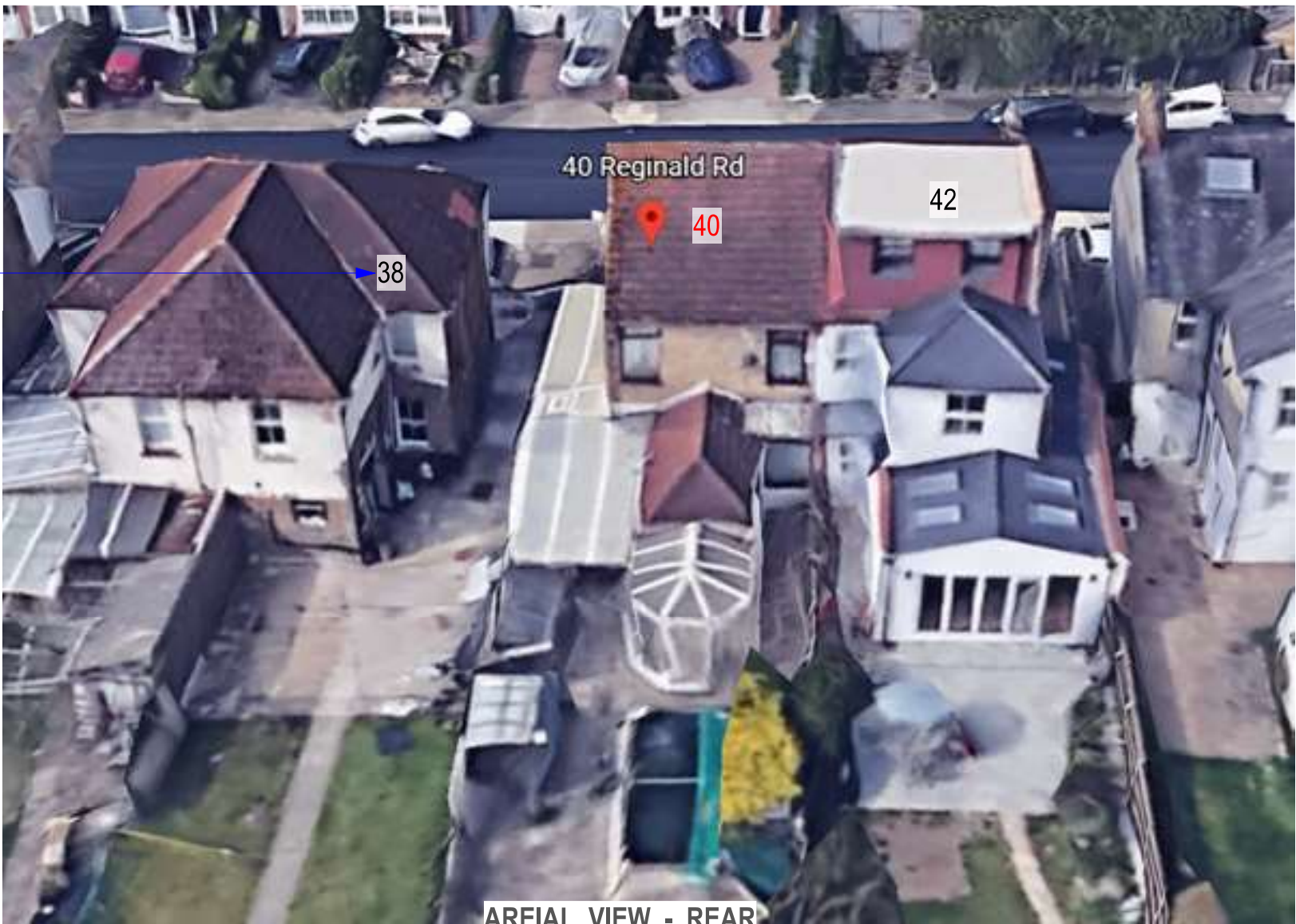
AREIAL VIEW - REAR showing application property and neighbouring properties.

Property now has an extension 38 Reginald Road - 21693/APP/2019/3127 - Side to rear wrap around extension (6m rear extension) Refer to drawing no. 08