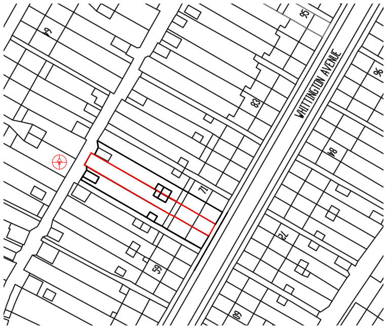
02 - OS MAP