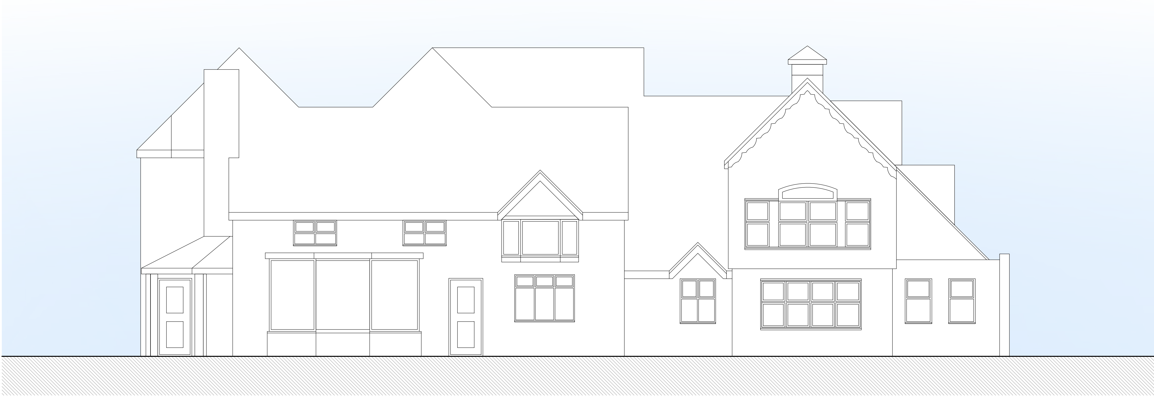
WEST FACING ELEVATION (COWLEY ROAD)