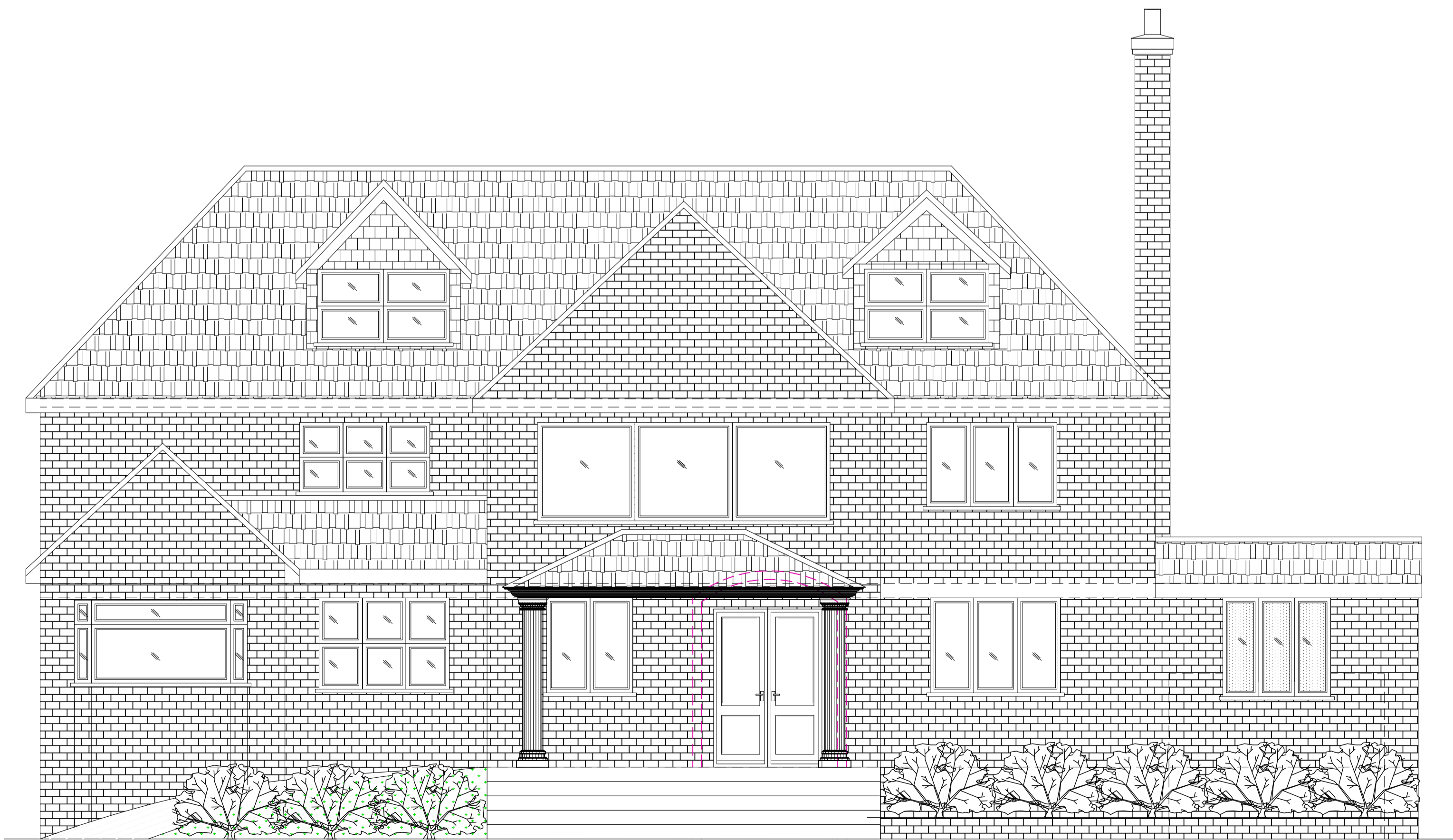
PROPOSED FRONT ELEVATION A SCALE 1:50