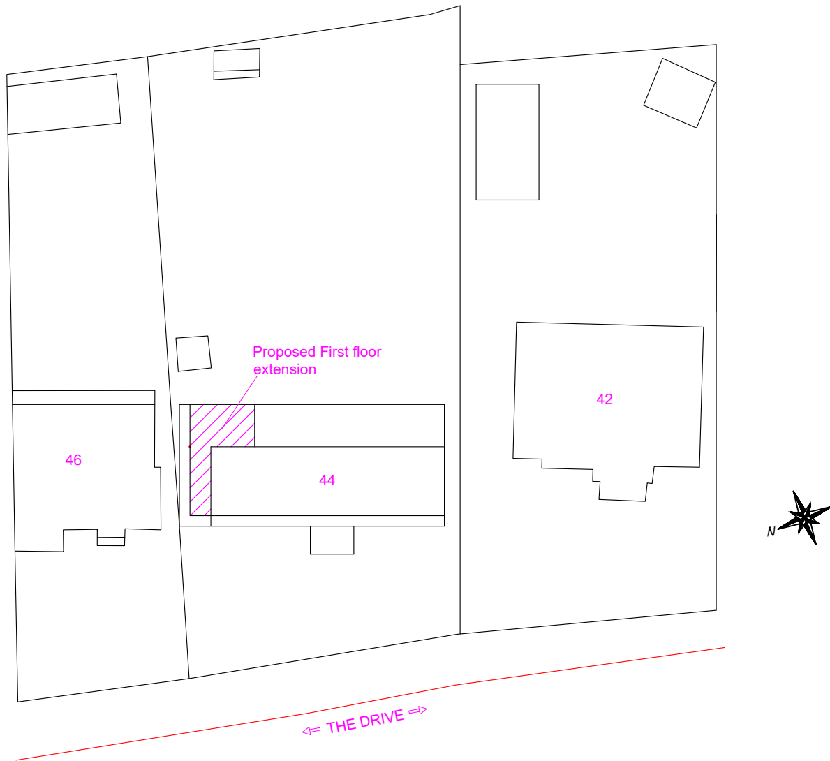
Site Plan @ Scale 1:500

Note: This Drawing is for planning purpose and should not be used for construction. All dimensions should be confirmed on site and any deviation should be reported back to designer.