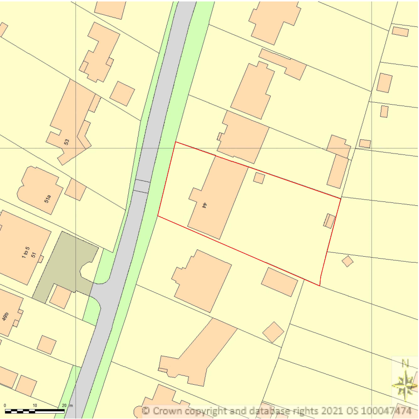
Location Plan @ 1:1250

First floor Side & Part rear extensions and rear dormers