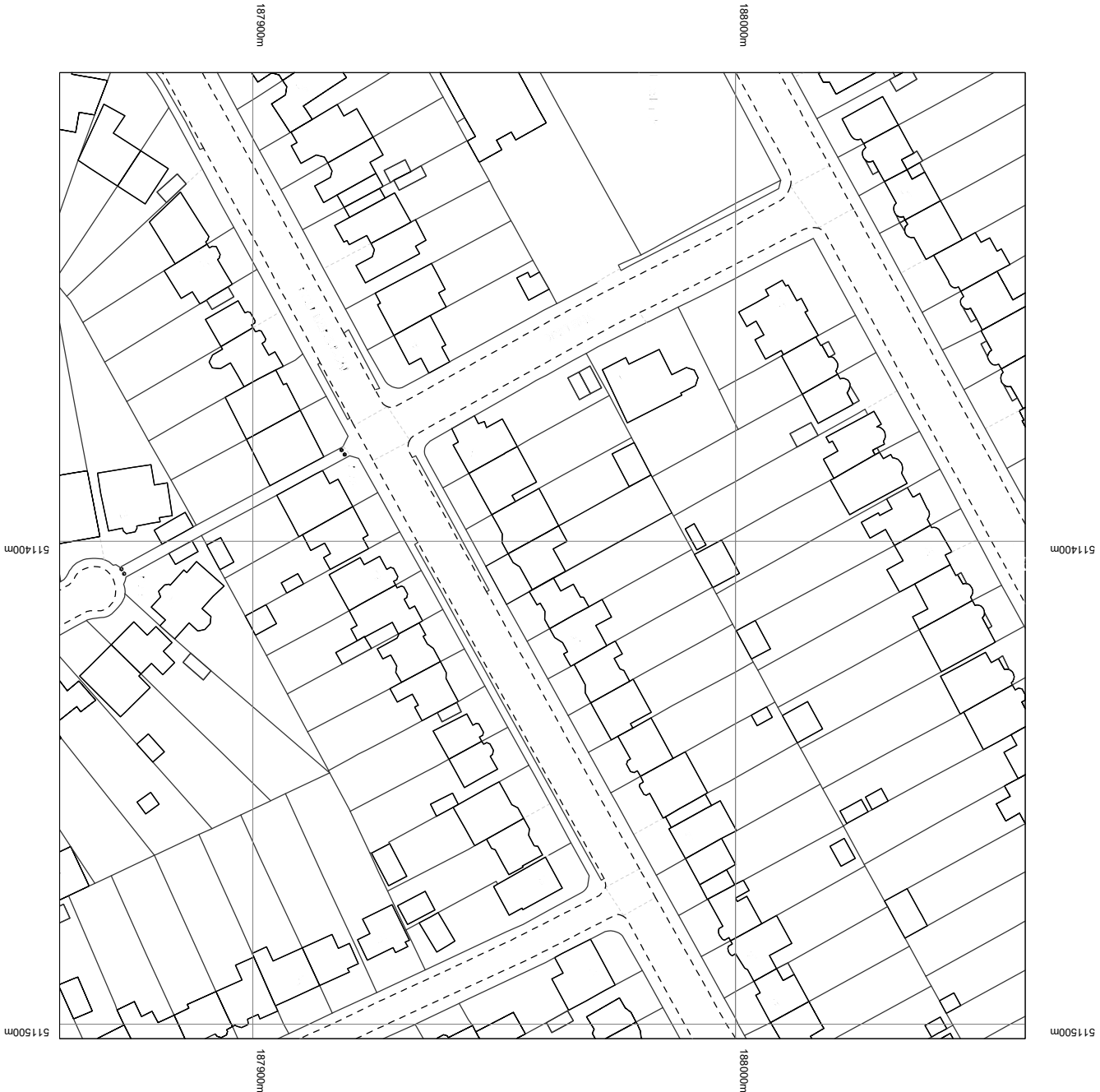
LOCATION PLAN (SCALE 1:1250)