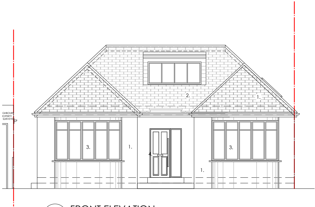
01 FRONT ELEVATION

Do not scale off this drawing. All dimensions to be verified on-site prior to construction and any discrepancies to be reported. All dimensions in millimeters unless stated Notes