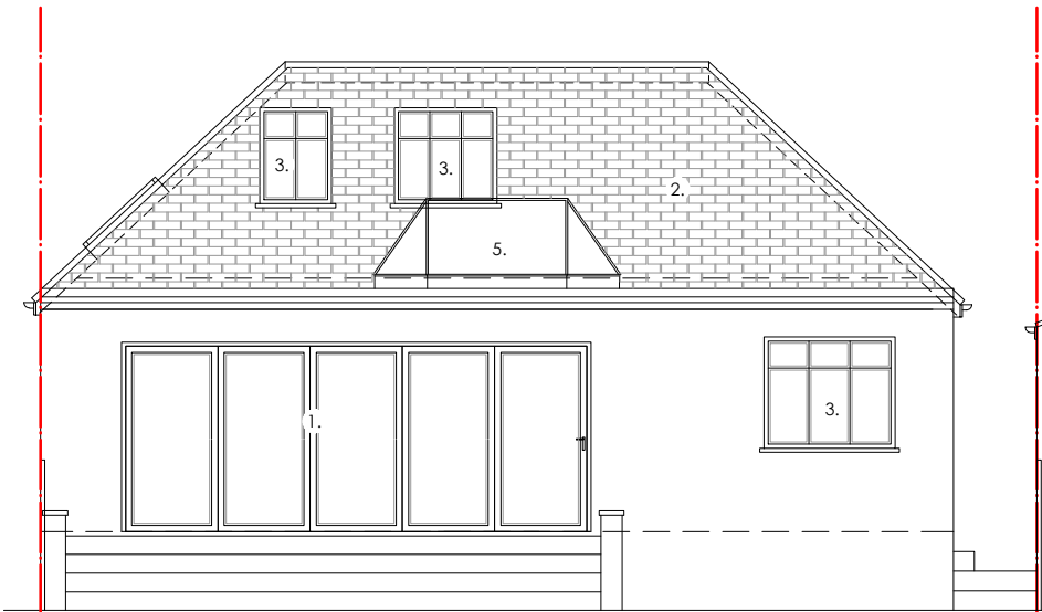
03 REAR ELEVATION