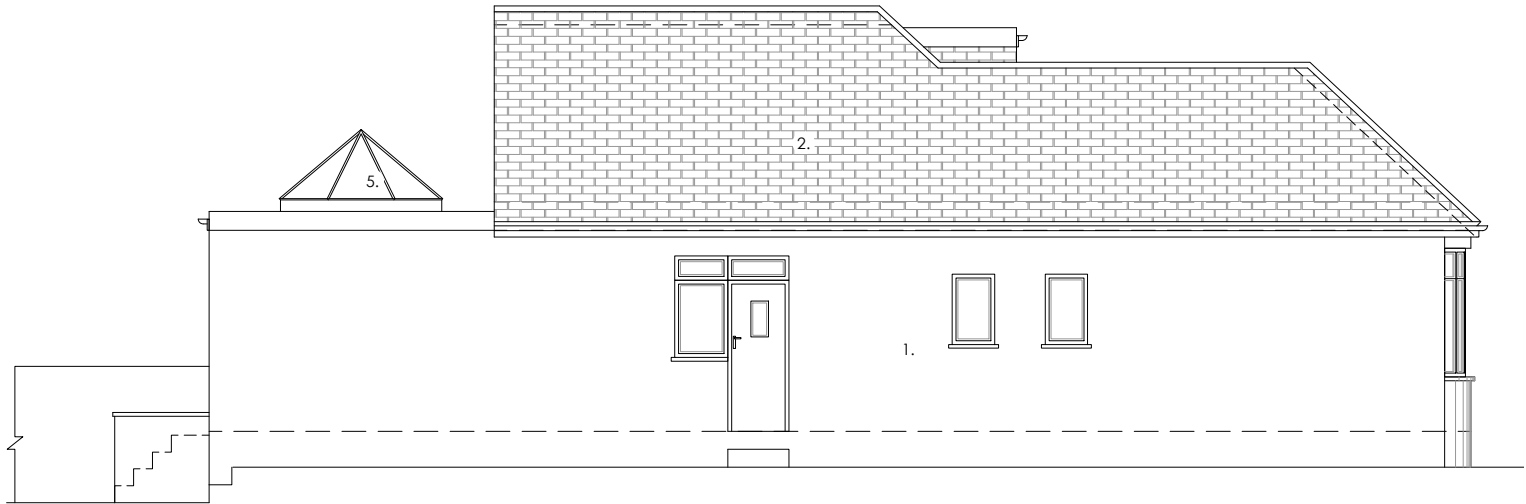
02 SIDE ELEVATION (NORTH)