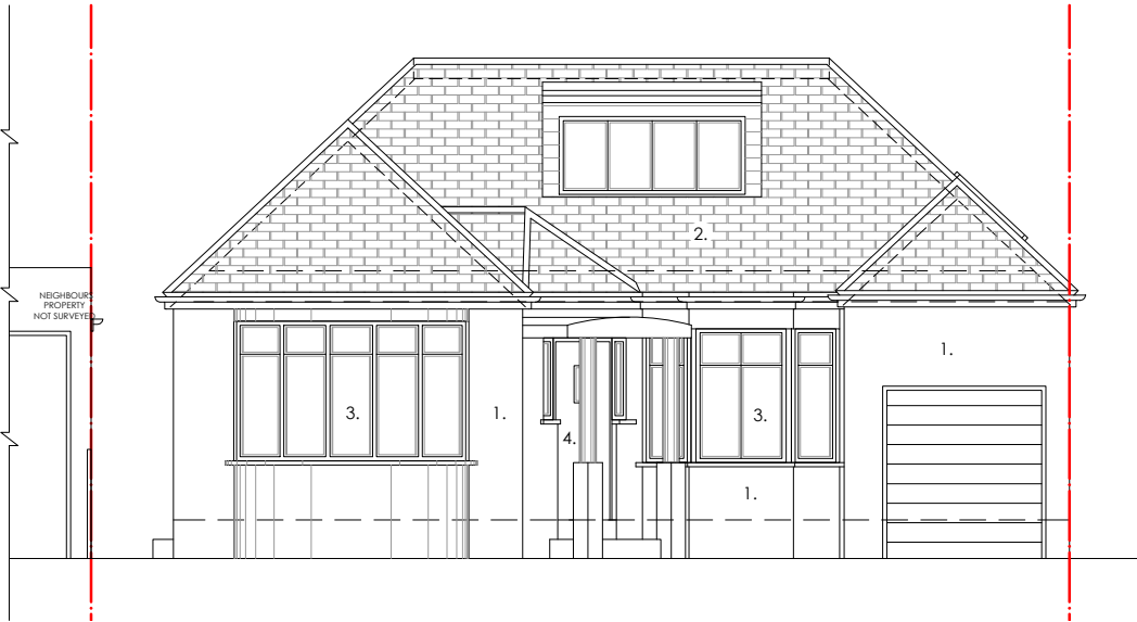
01 FRONT ELEVATION