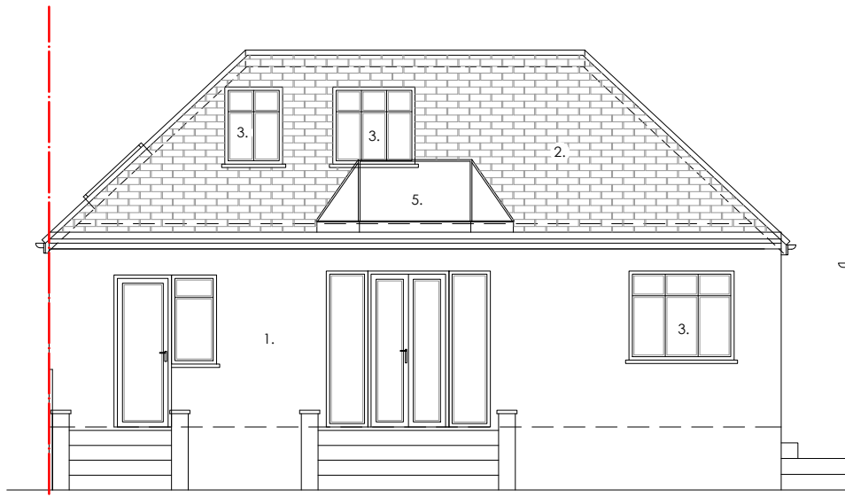
04 REAR ELEVATION