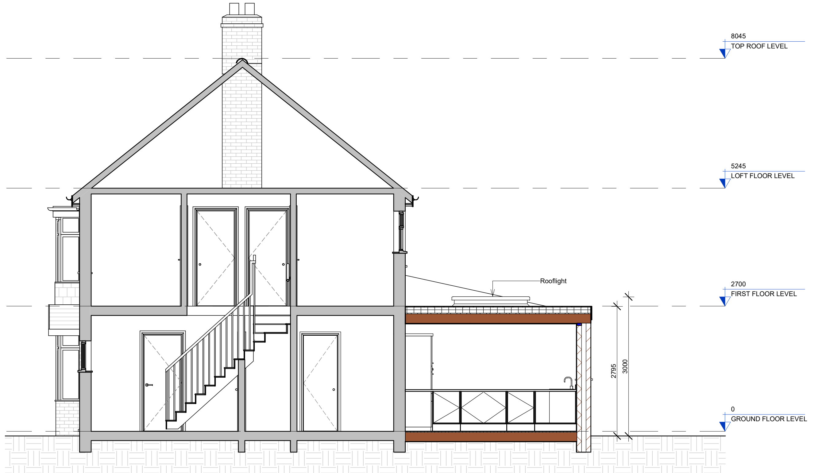
PP-PROPOSED SECTION A 1 : 50