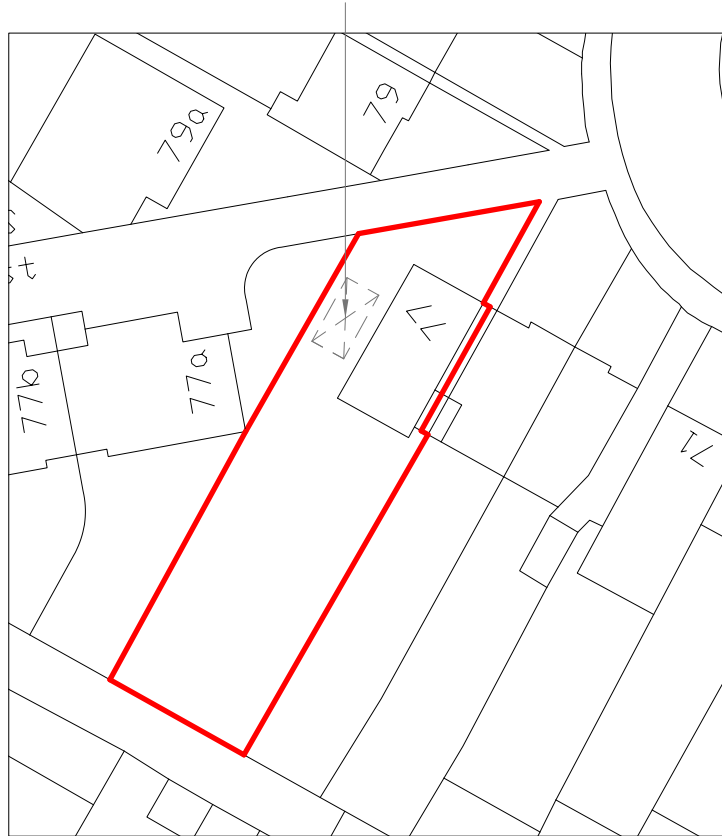
Existing Block Plan Scale 1:500