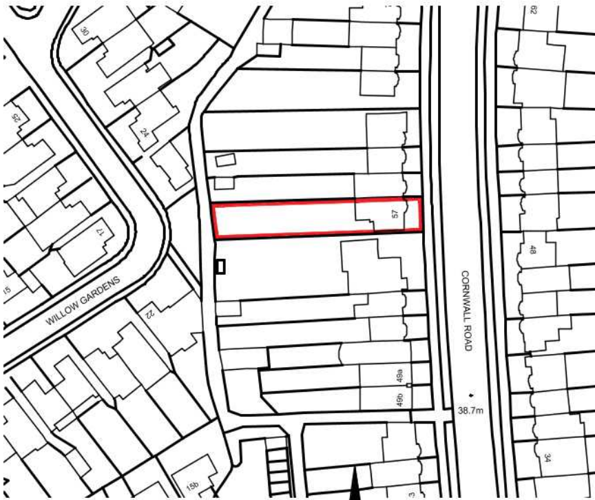
Existing Site Location Plan Scale - 1:1250 10m 0 10 20 30 40 50 60 1:1250