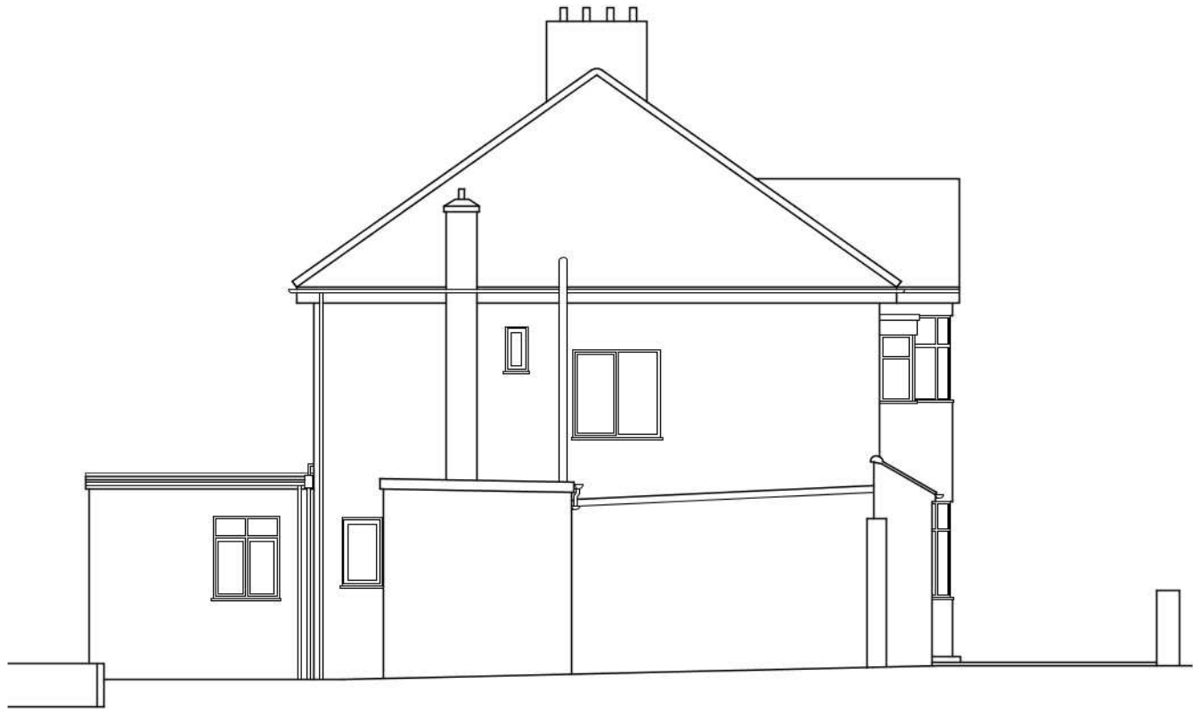
Existing Side Elevation Scale - 1:100