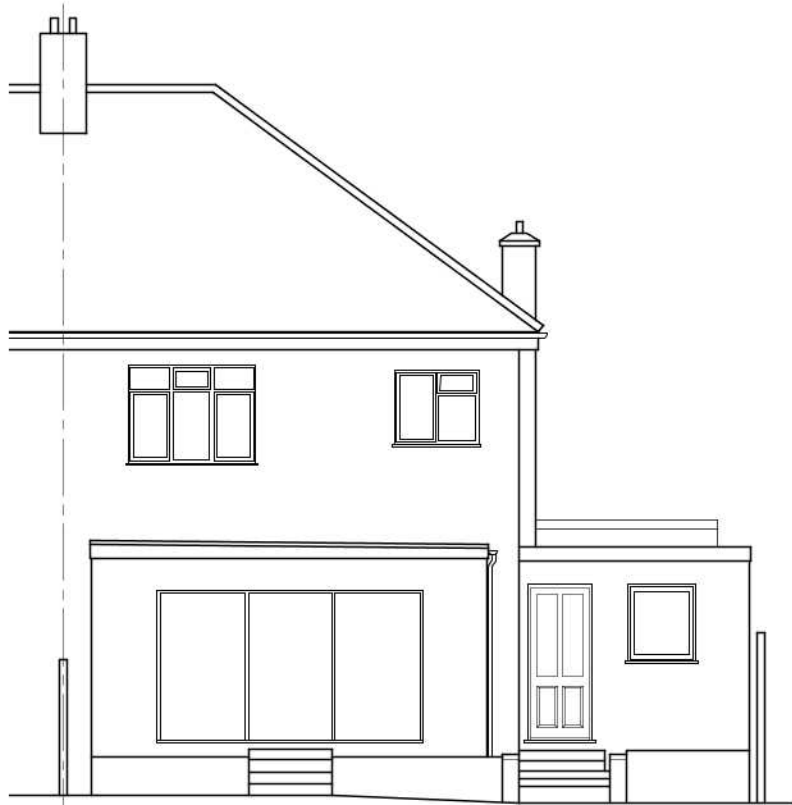
Existing Rear Elevation Scale - 1:100 1m 0 1m 2 3 4 5 1:100