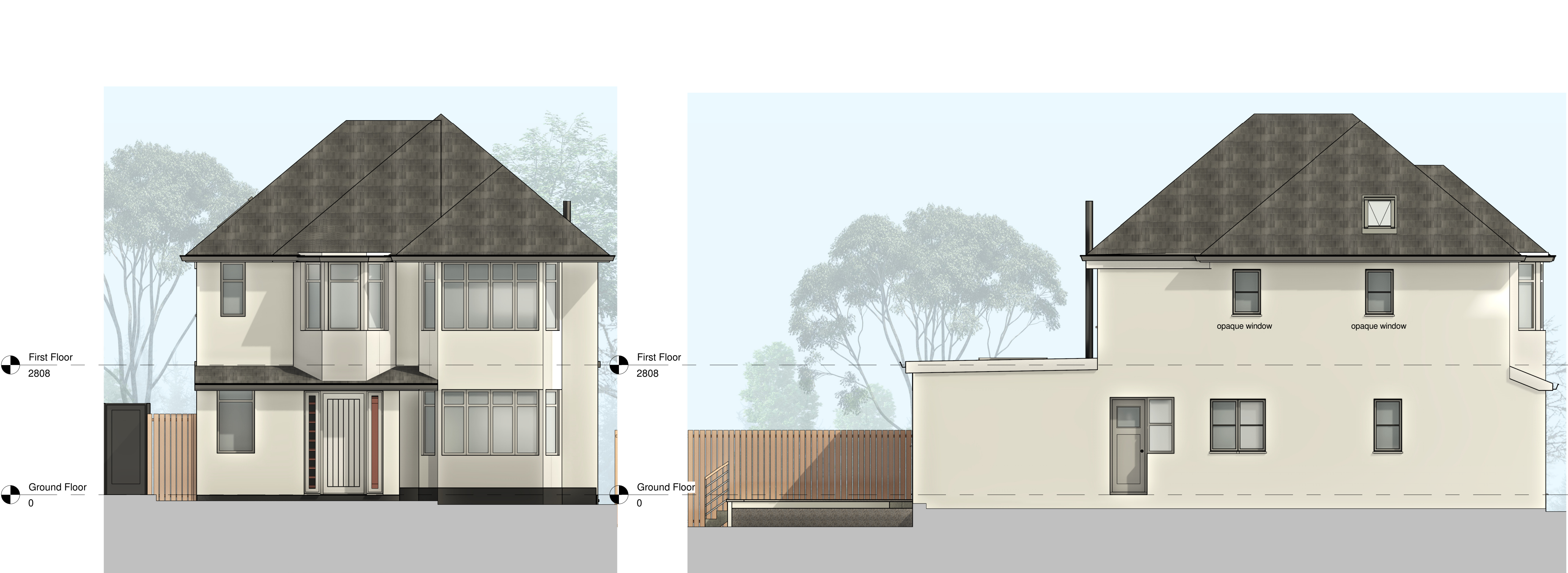
Front Elevation 1 : 50