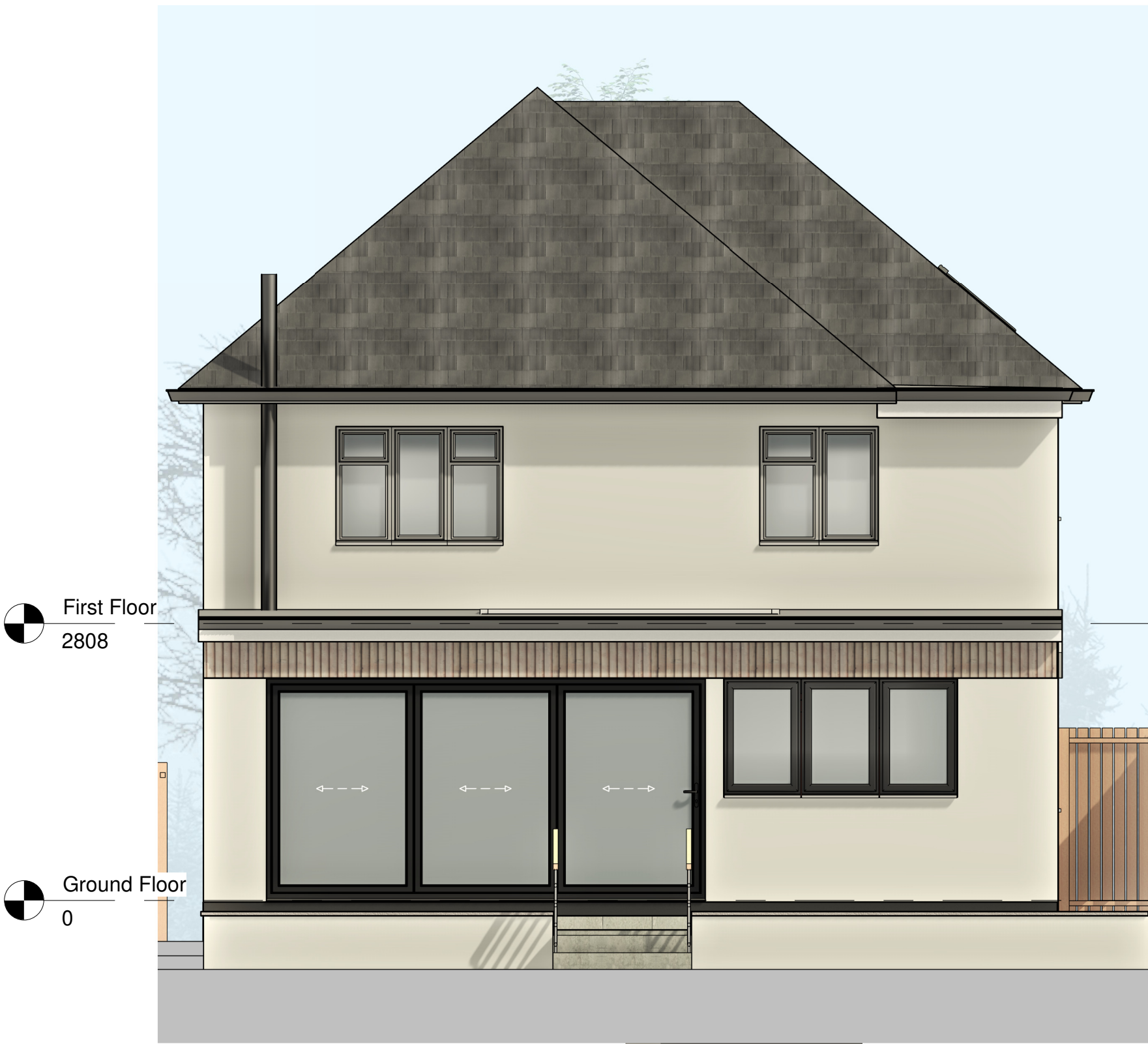
Rear Elevation 1 : 50