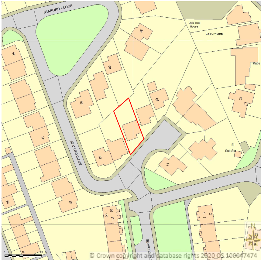
Location Plan@ 1:500