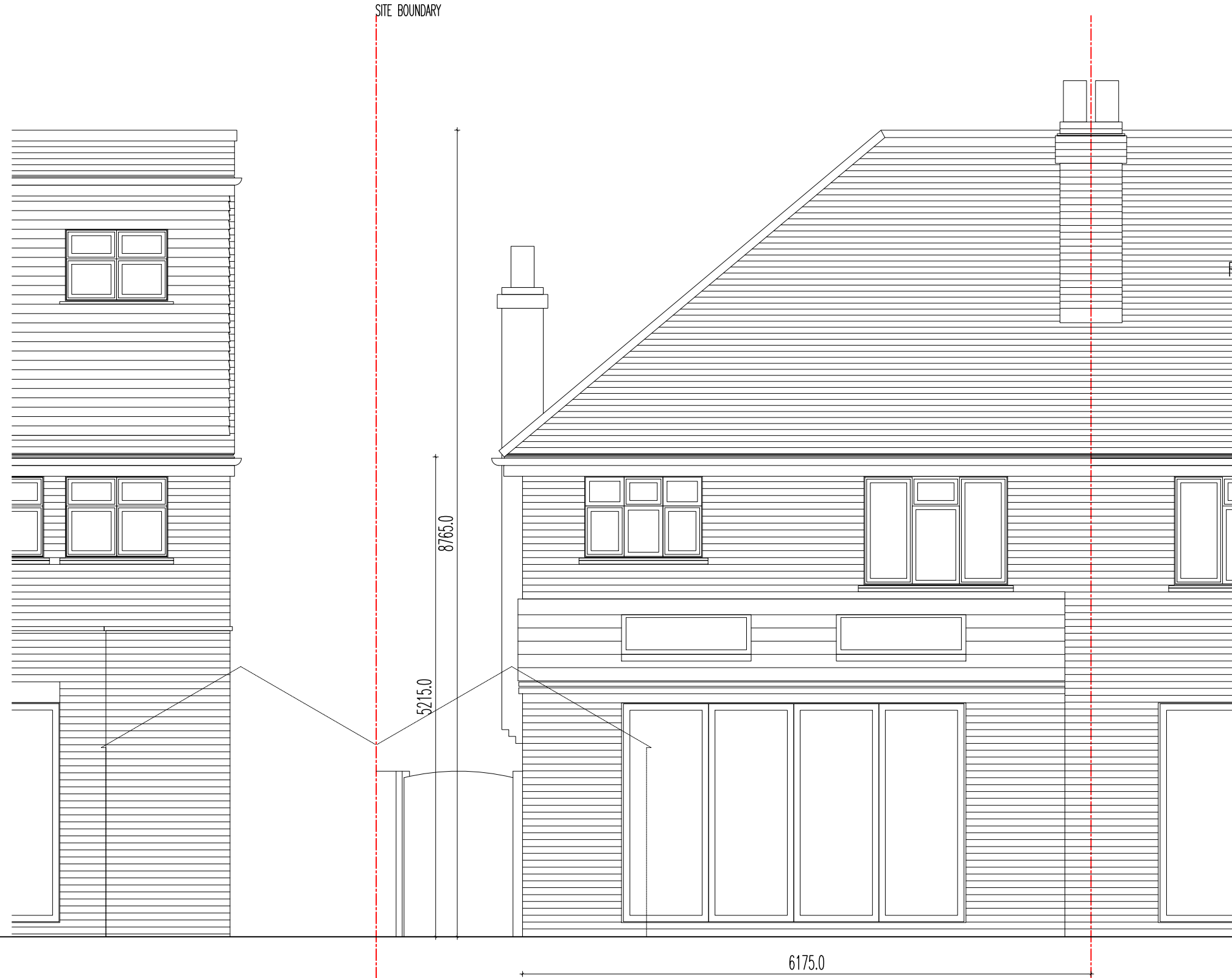
BACK ELEVATION AS EXISTING