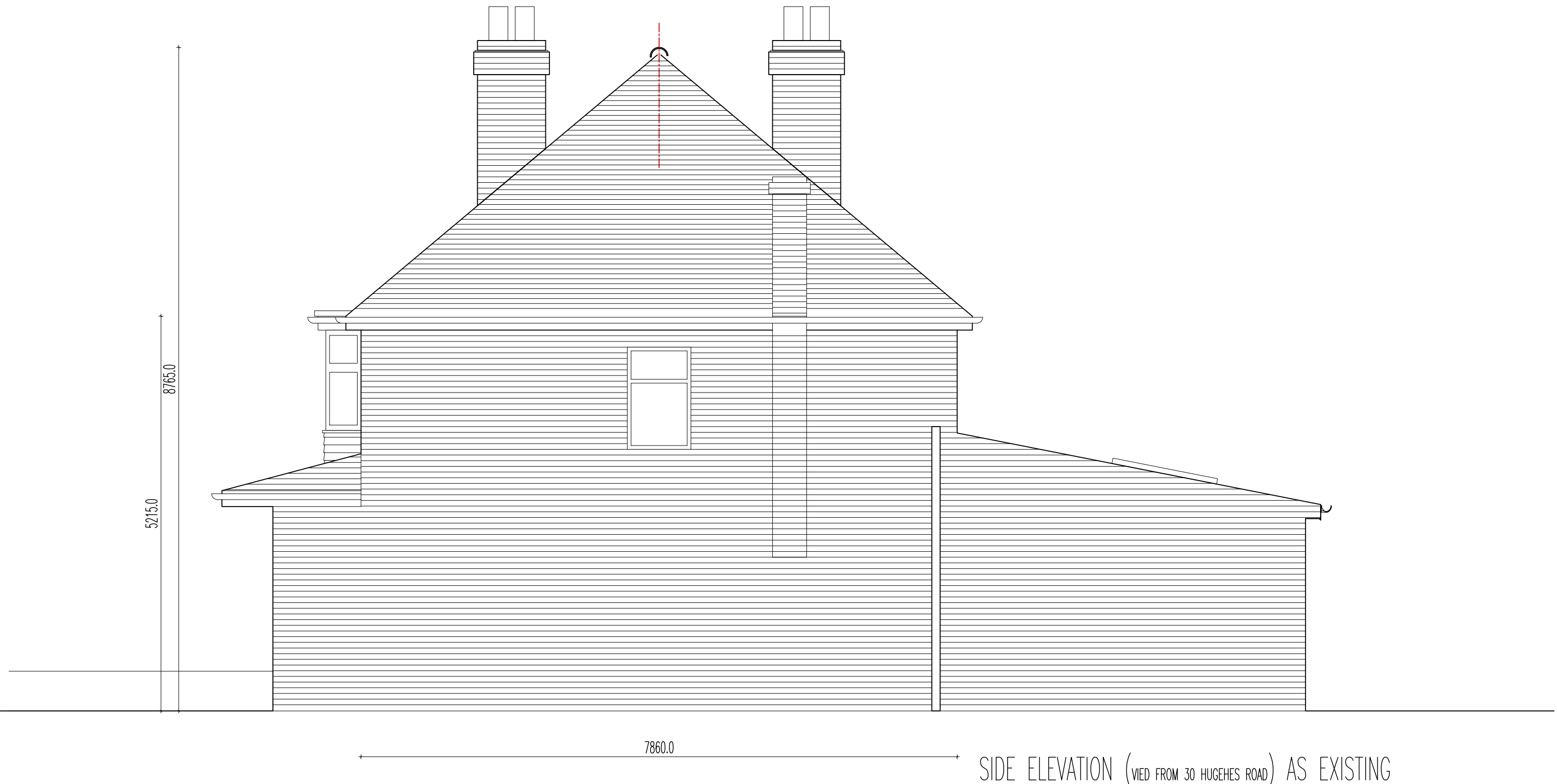
SIDE ELEVATION (VIED FROM 30 HUGHES ROAD) AS EXISTING