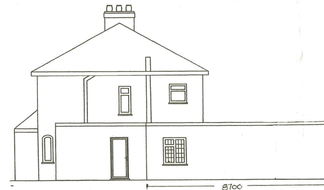
Proposed Side Elevation View From No.16