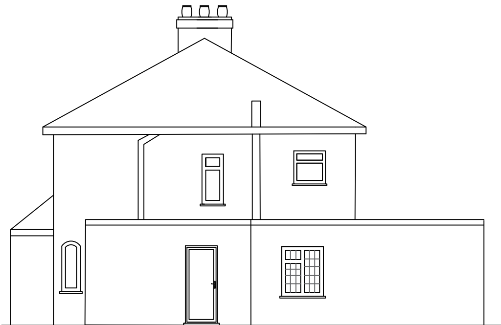
Proposed Side Elevation View From No.16