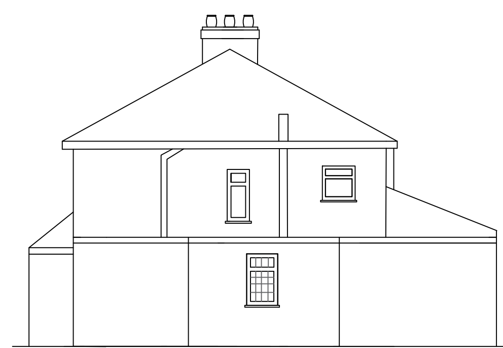
Proposed Side Elevation View From No.16