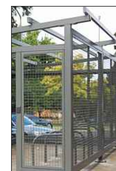
Reference image for steel mesh panel to be used at bike store