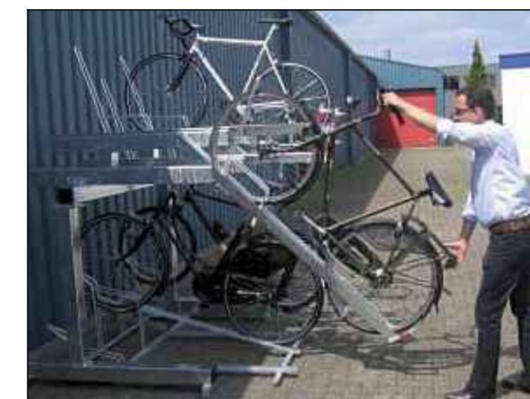
Reference images for typical double stacking cycle parking system