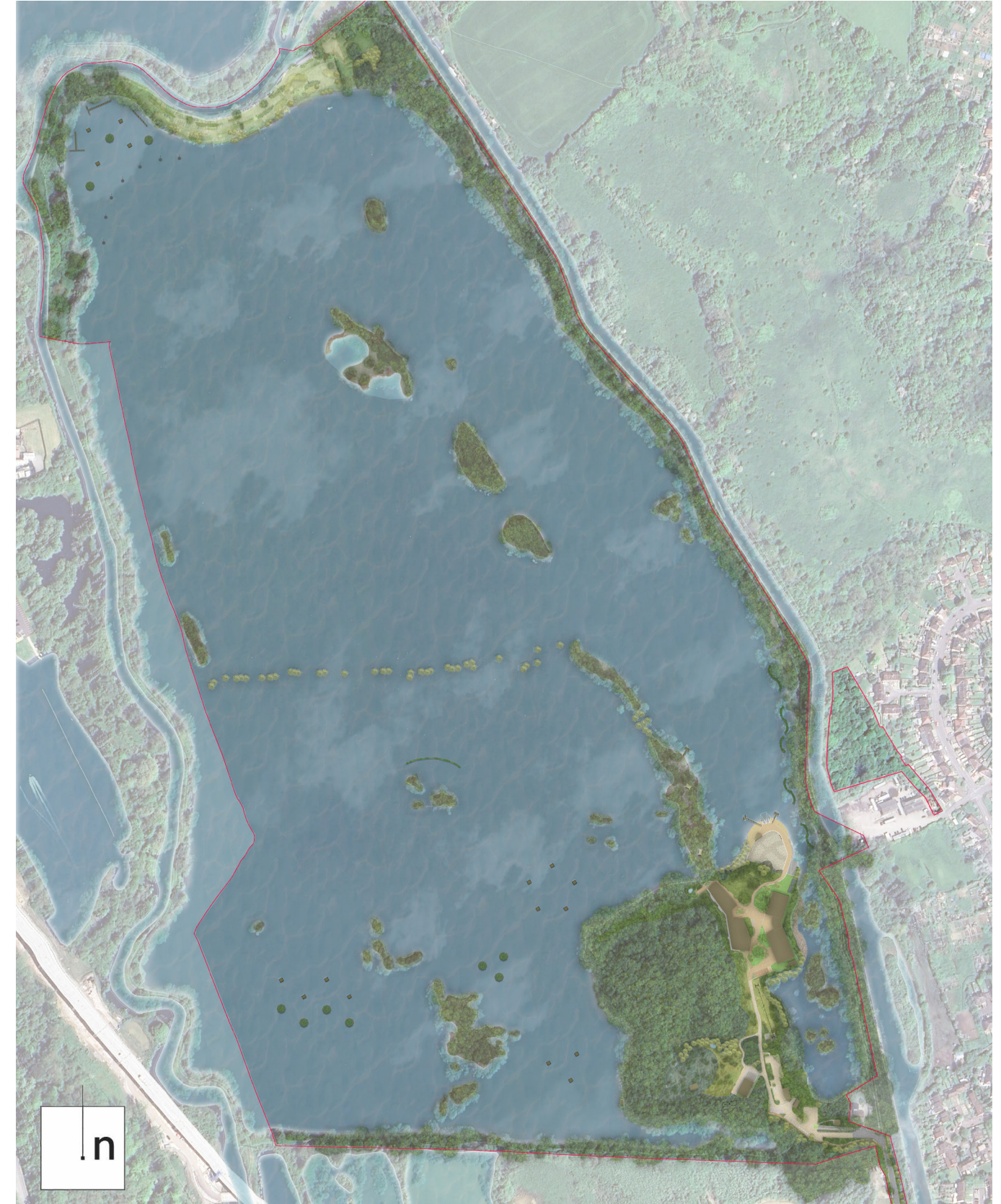
New revised scheme