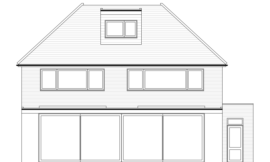
EXISTING REAR ELEVATION 1:100