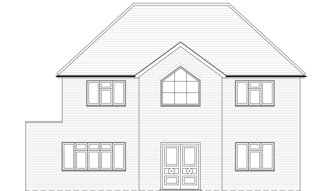
EXISTING FRONT ELEVATION 1:100