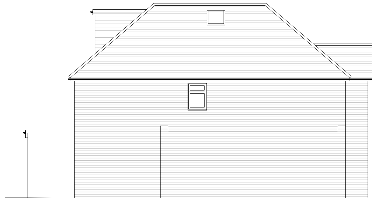
EXISTING SIDE ELEVATION 1:100