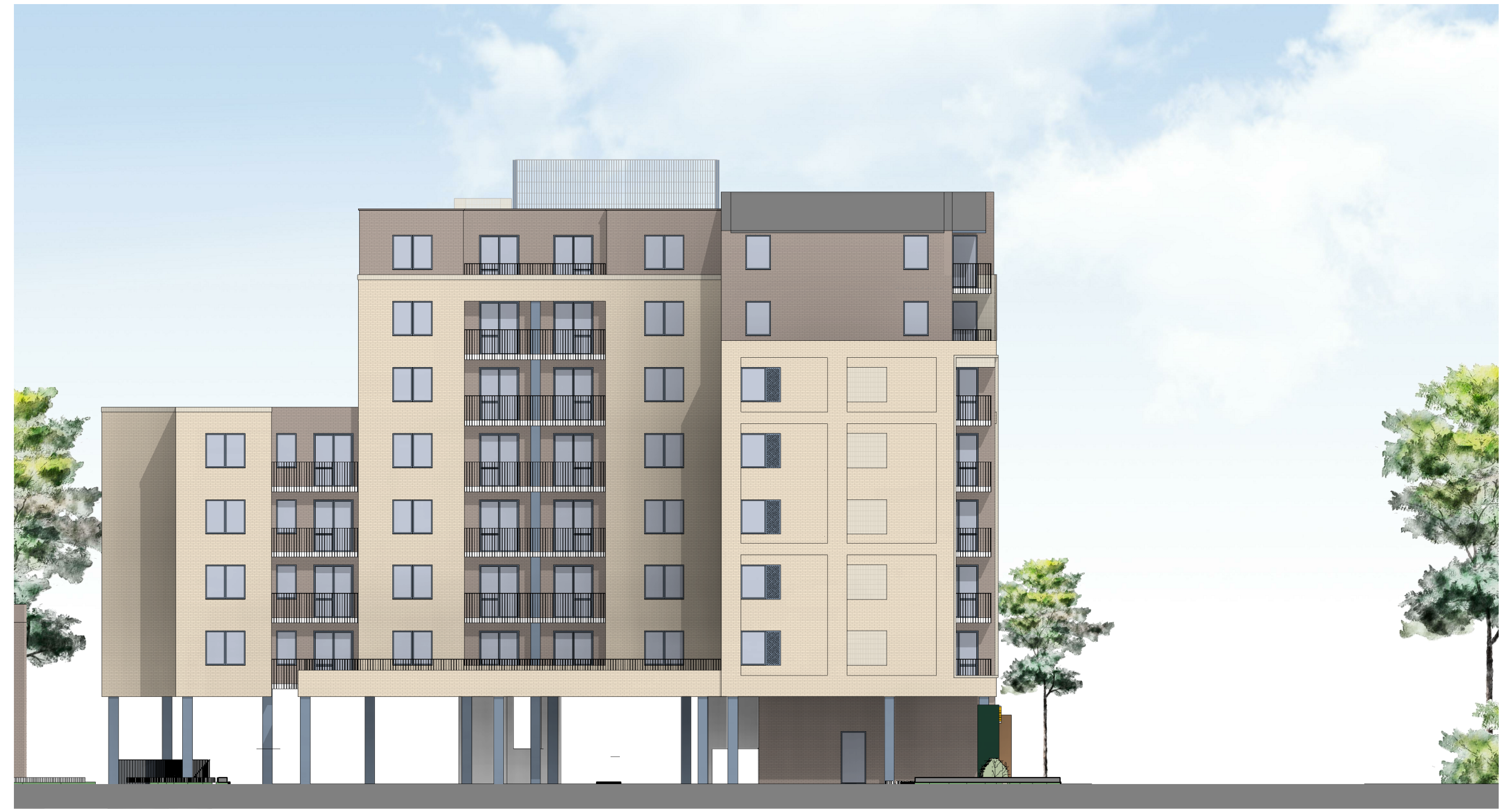
7 Block C - NW Elevation 1 : 200