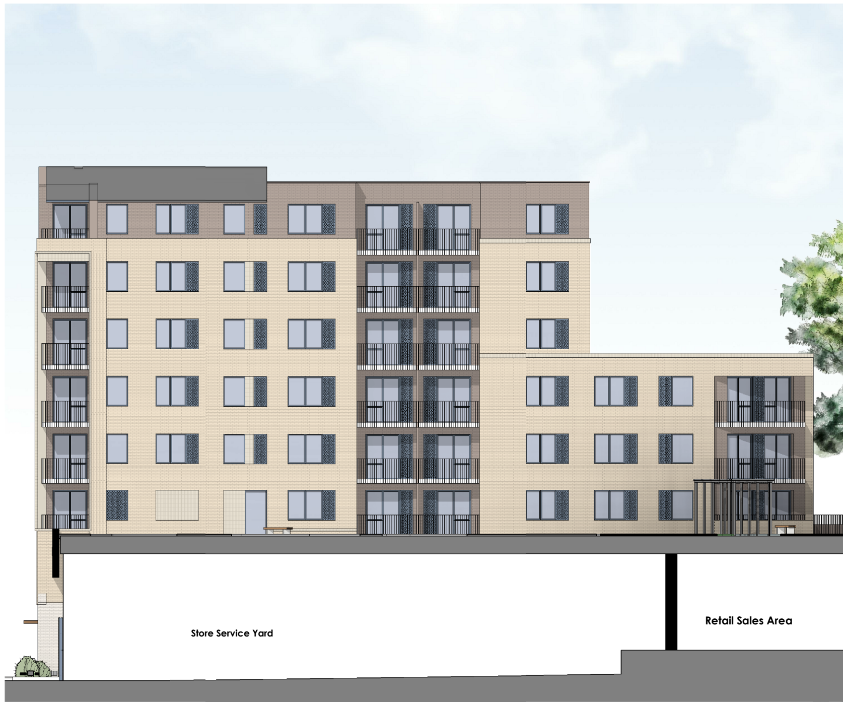
5 Block C - Podium - SE Elevation 1 : 200