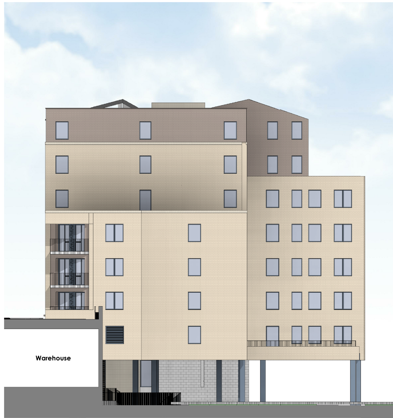
6 Block C - NE Elevation 1 : 200