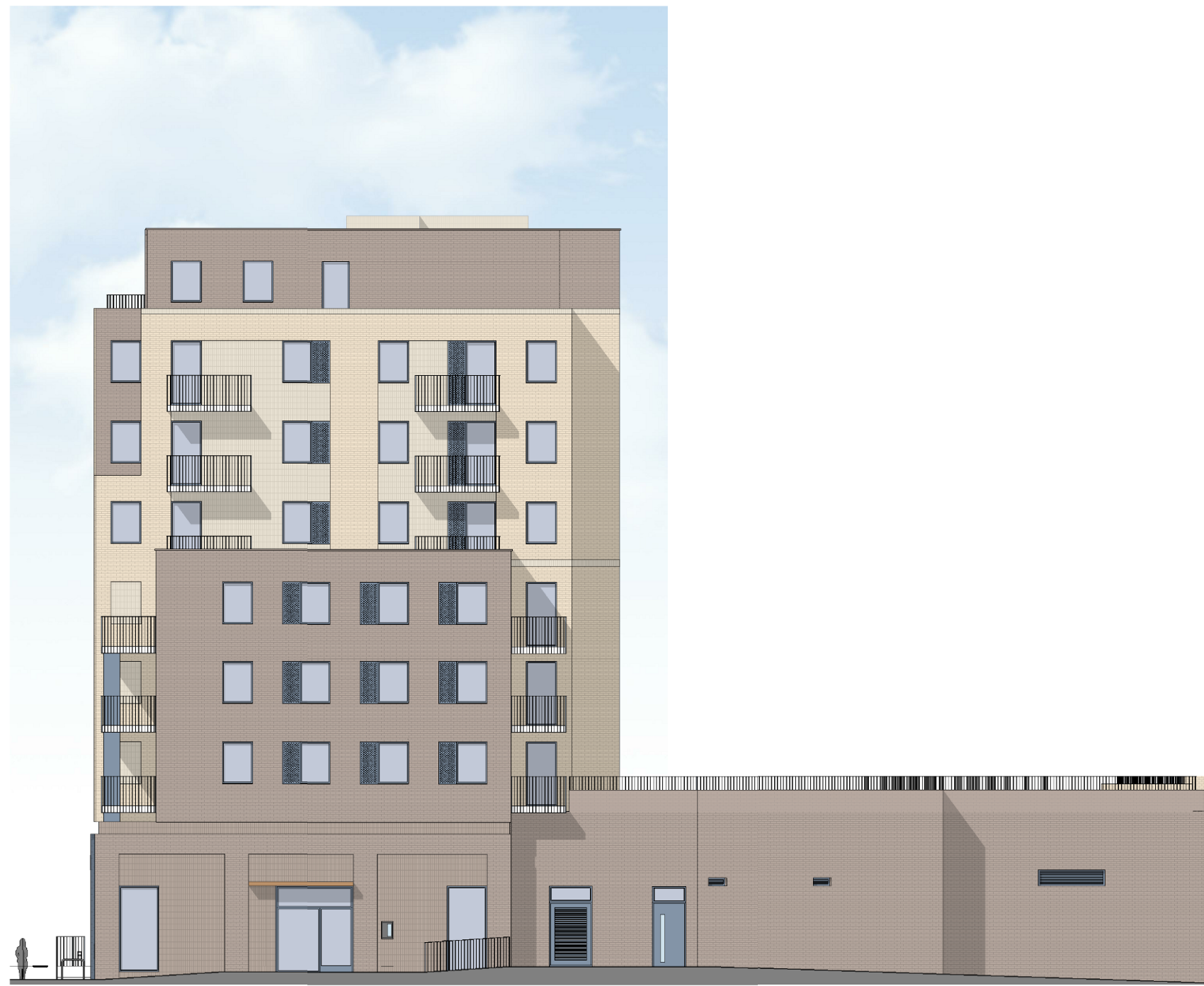
1 Block A&B - N Elevation 1 : 200