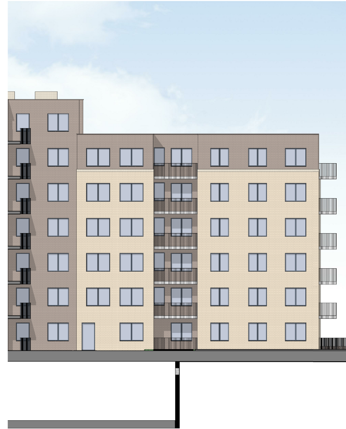
3 Block A&B - Podium - N Elevation 1 : 200