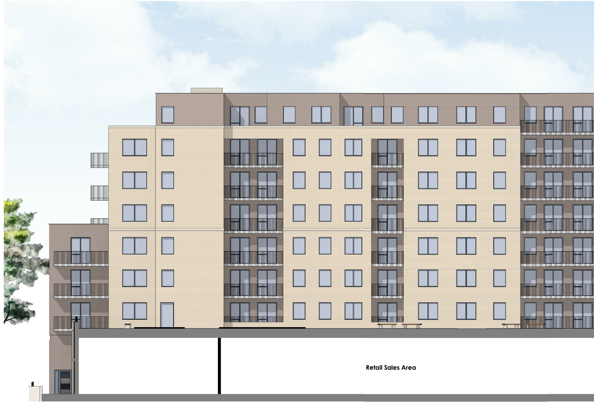
2 Block A&B - Podium - NW Elevation 1 : 200