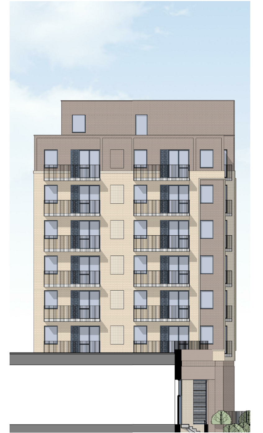
4 Block A&B - Podium -W Elevation 1 : 200