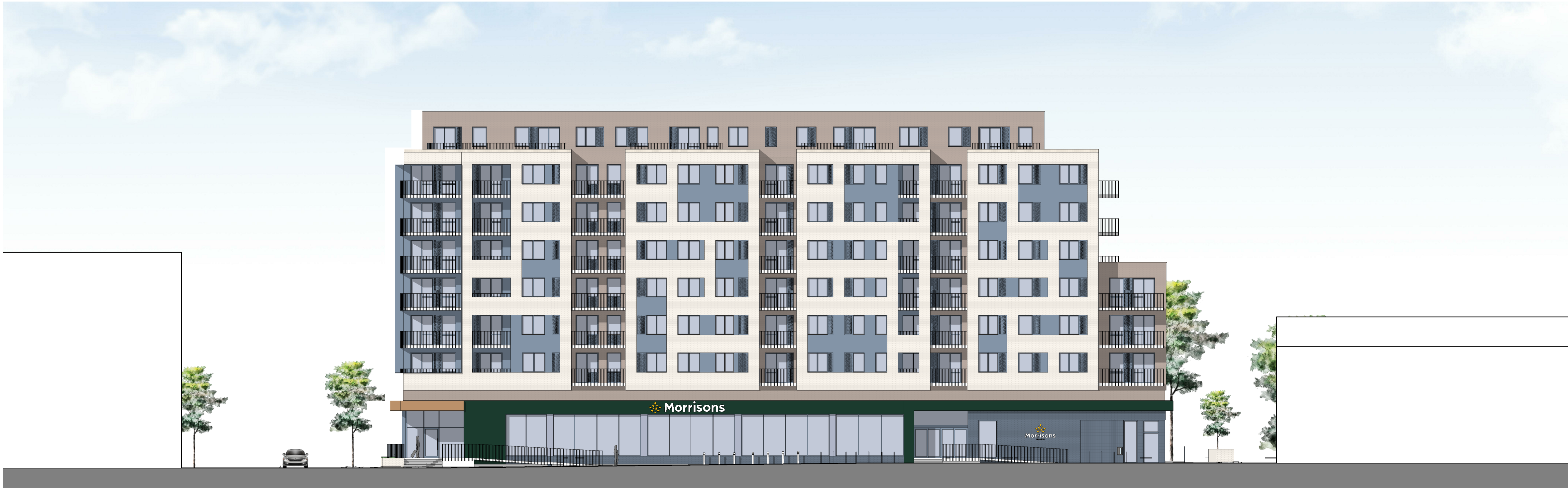
High Street Elevation 1 : 200