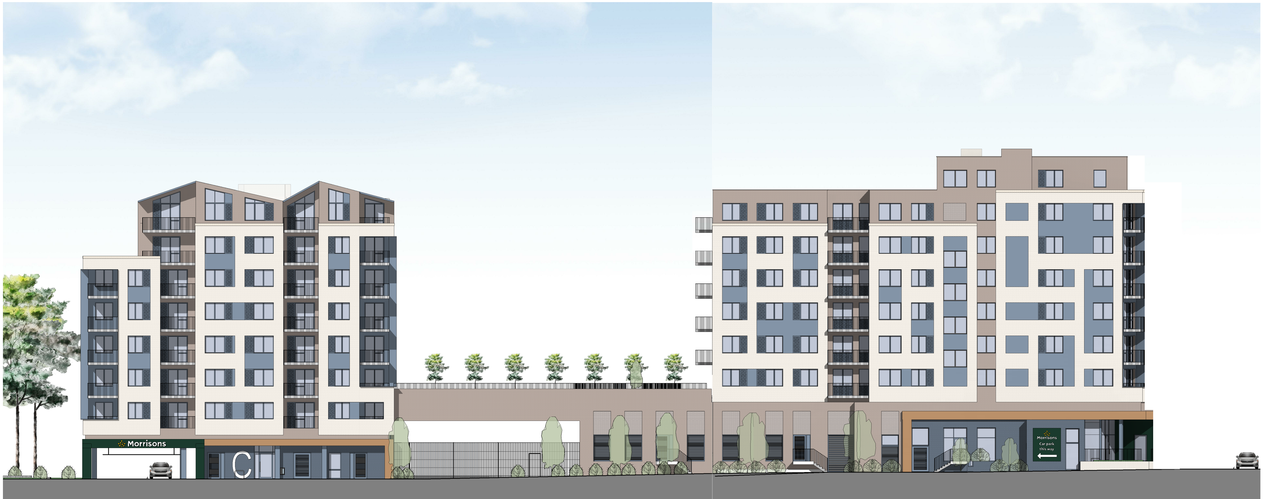
St Stephen's Road West Elevation 1 : 200