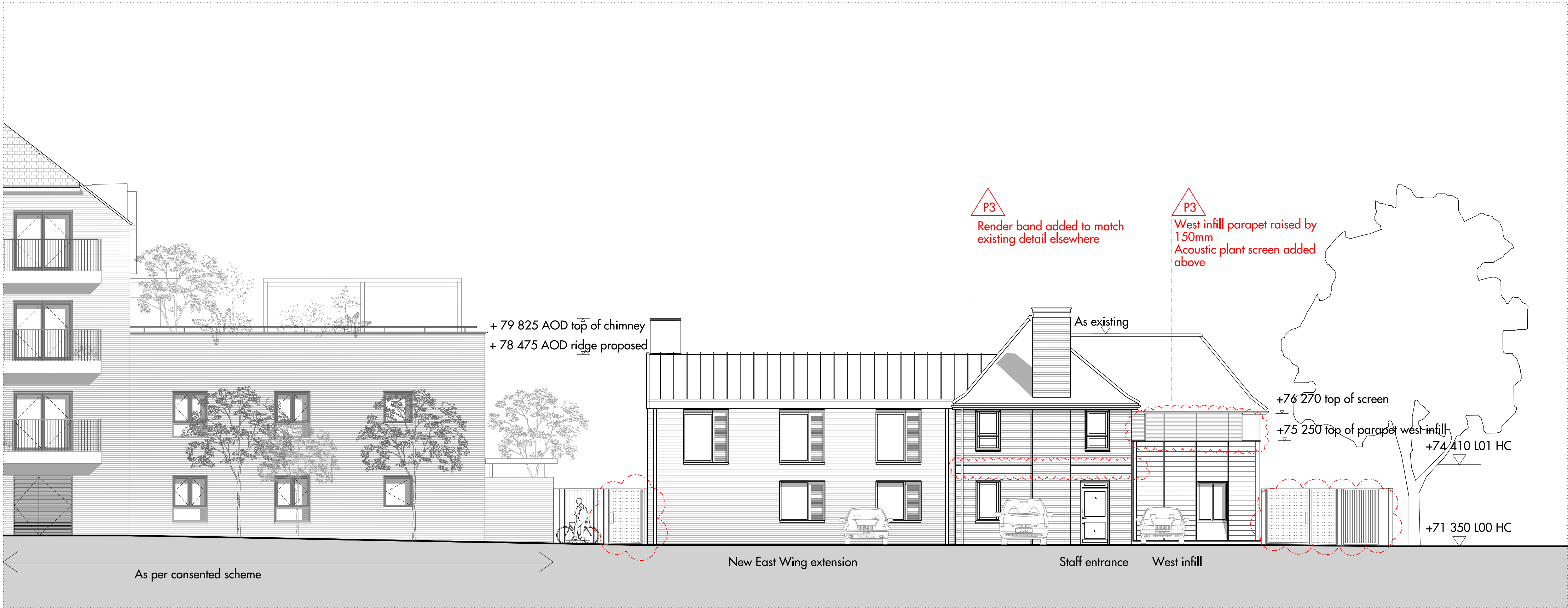
01 NORTH ELEVATION

Northwood & Pinner Cottage Hospital elevations are based on survey drawings. Windows will be replaced throughout. In critical elevations such as South and southern edge of East and South elevation. New windows to match existing types including including profiles and glazed subdivision.