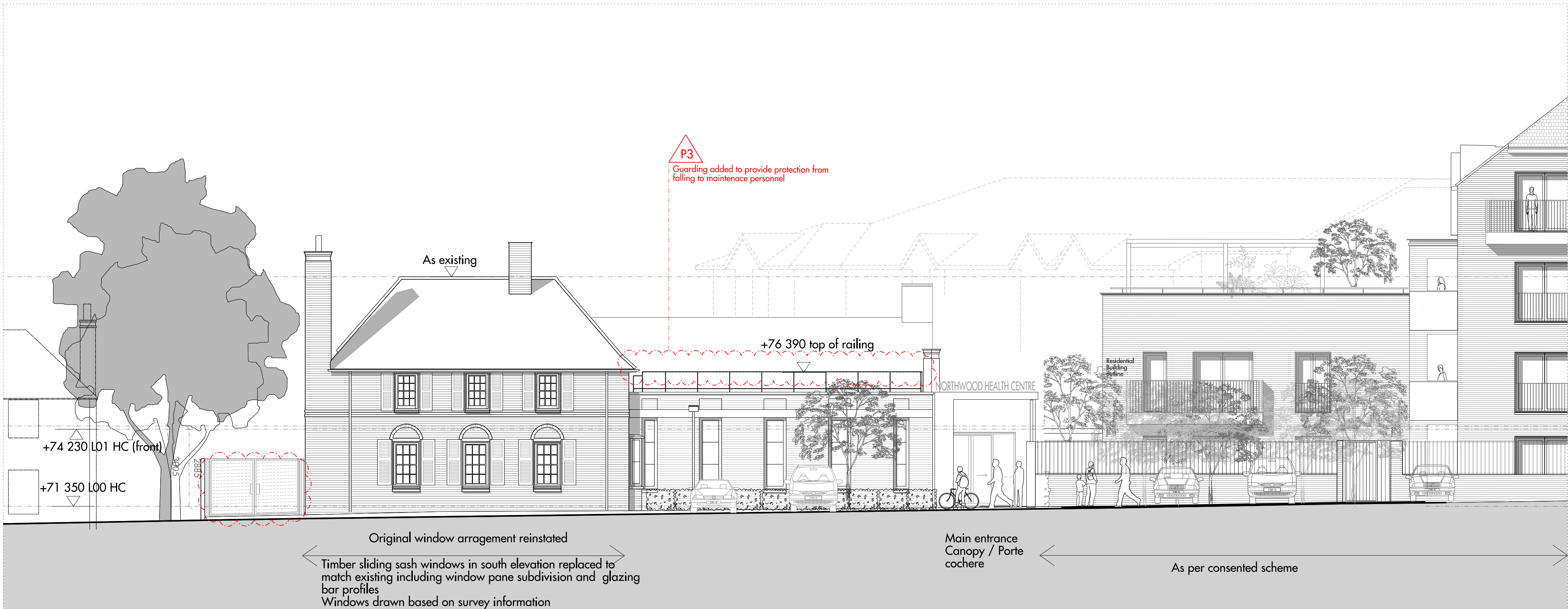
02 SOUTH ELEVATION