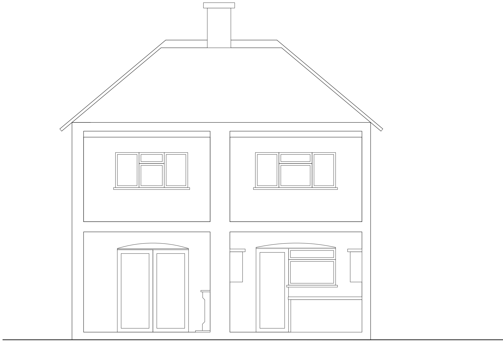
1 SECTION A-A Scale 1:50