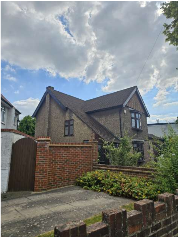
3 - Cherry Orchard