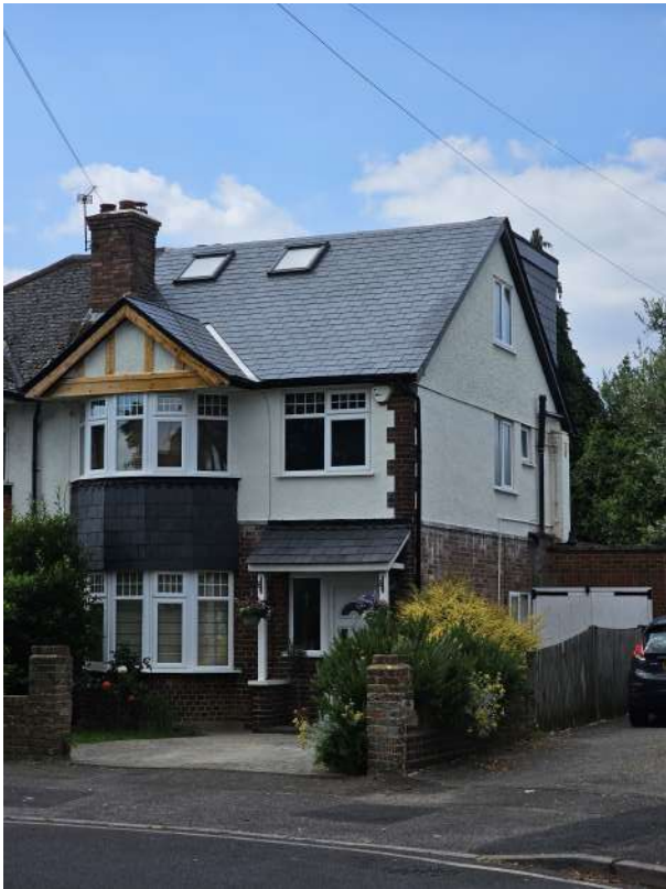
2 - Cherry Orchard