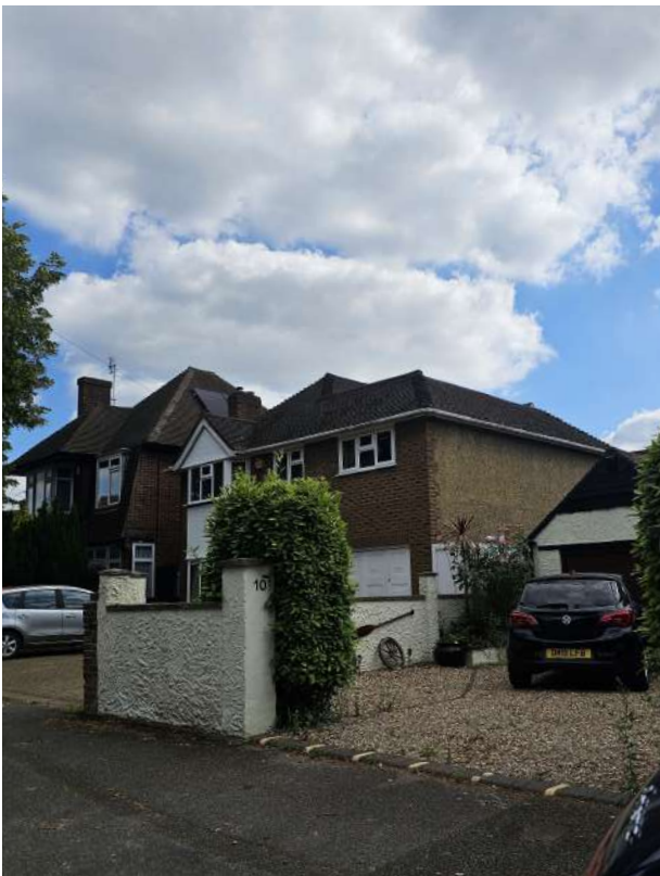
4 - Cherry Orchard