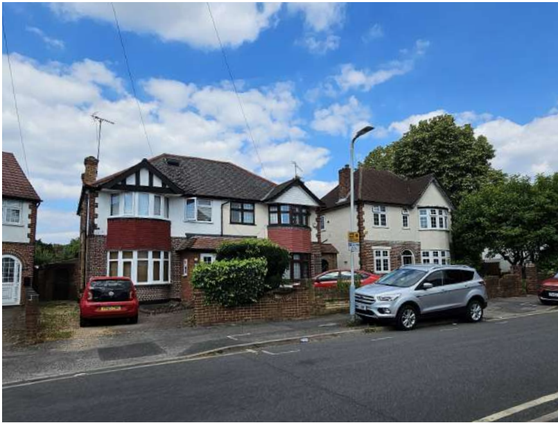
5 - Cherry Orchard