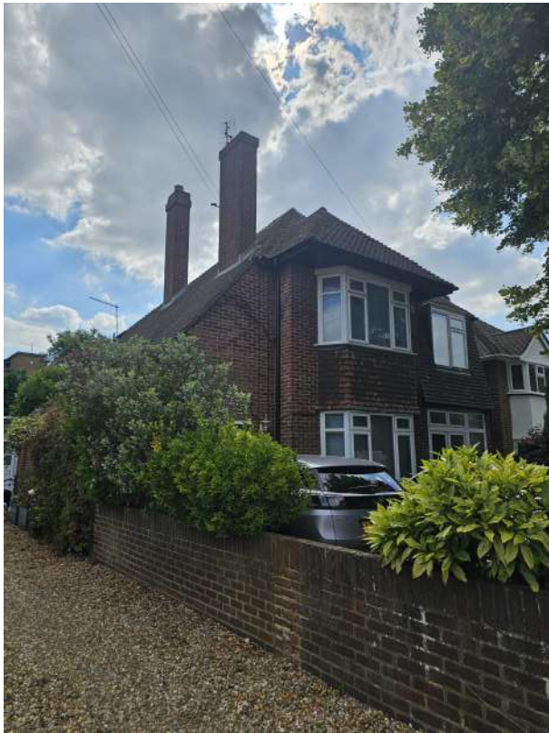
1 - Cherry Orchard