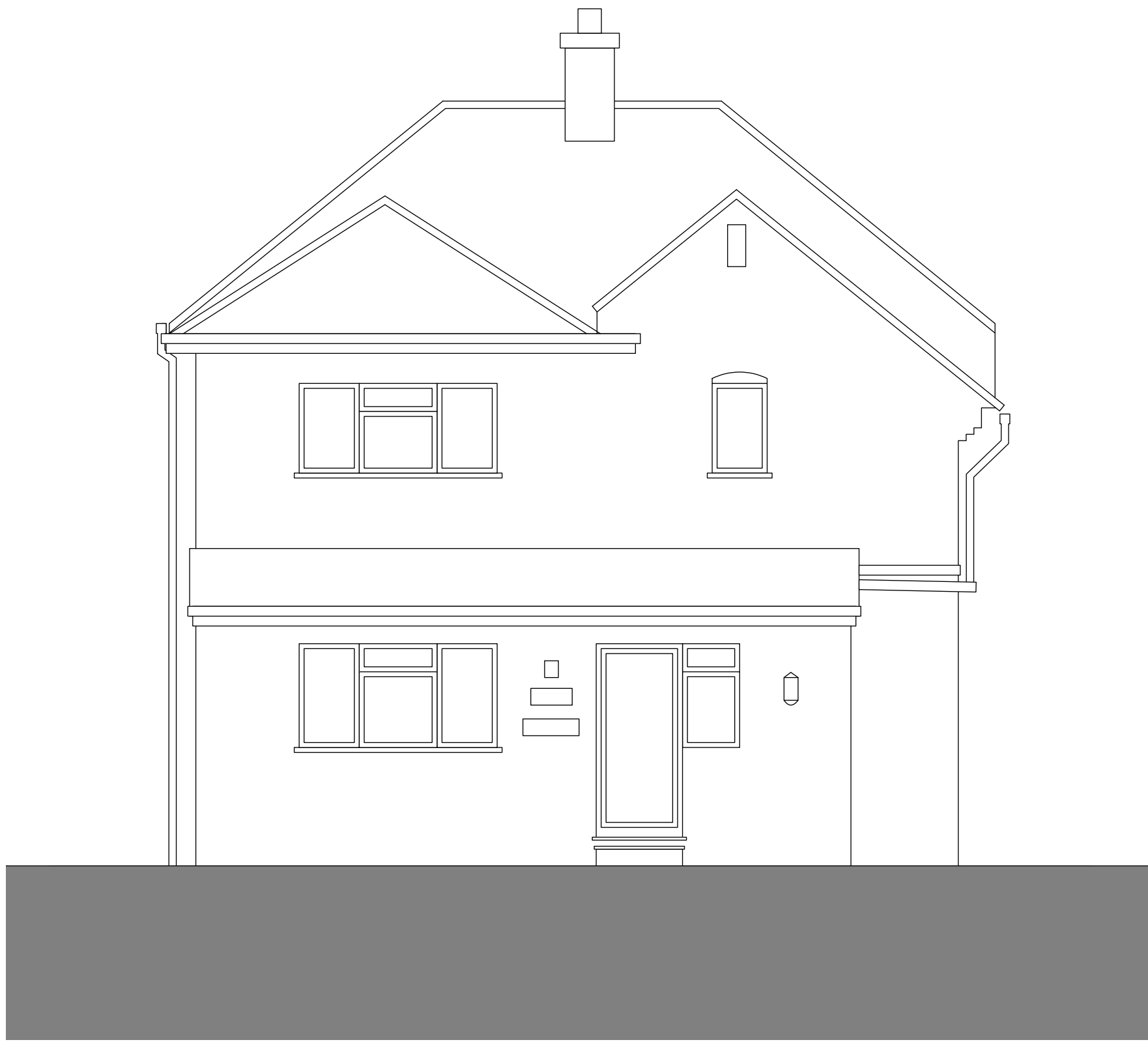
2 NORTH Scale 1:50