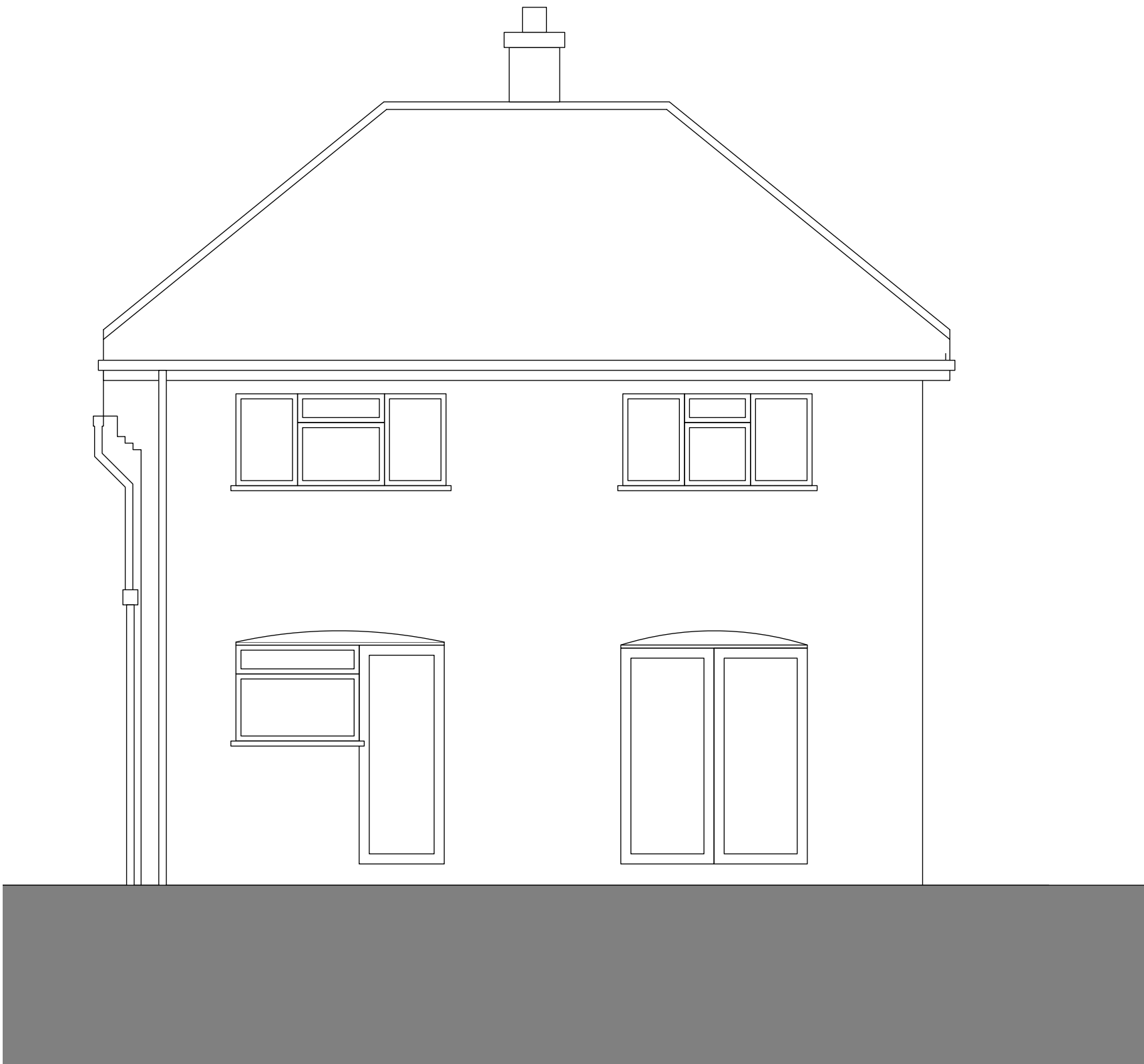
3 SOUTH Scale 1:50