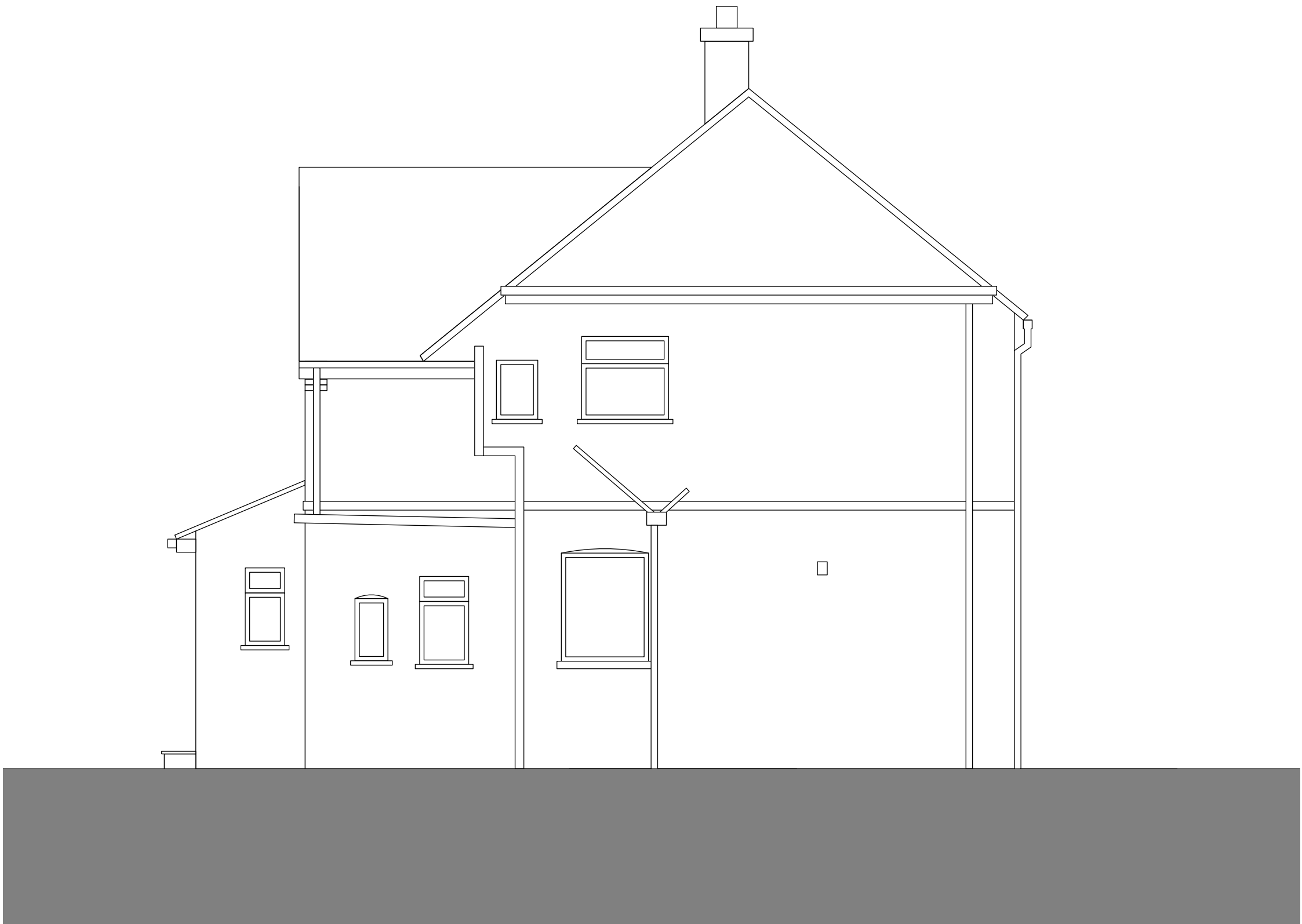
4 SOUTH Scale 1:50