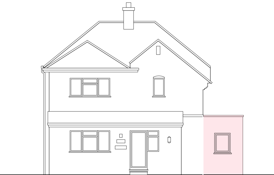
1 North (front)