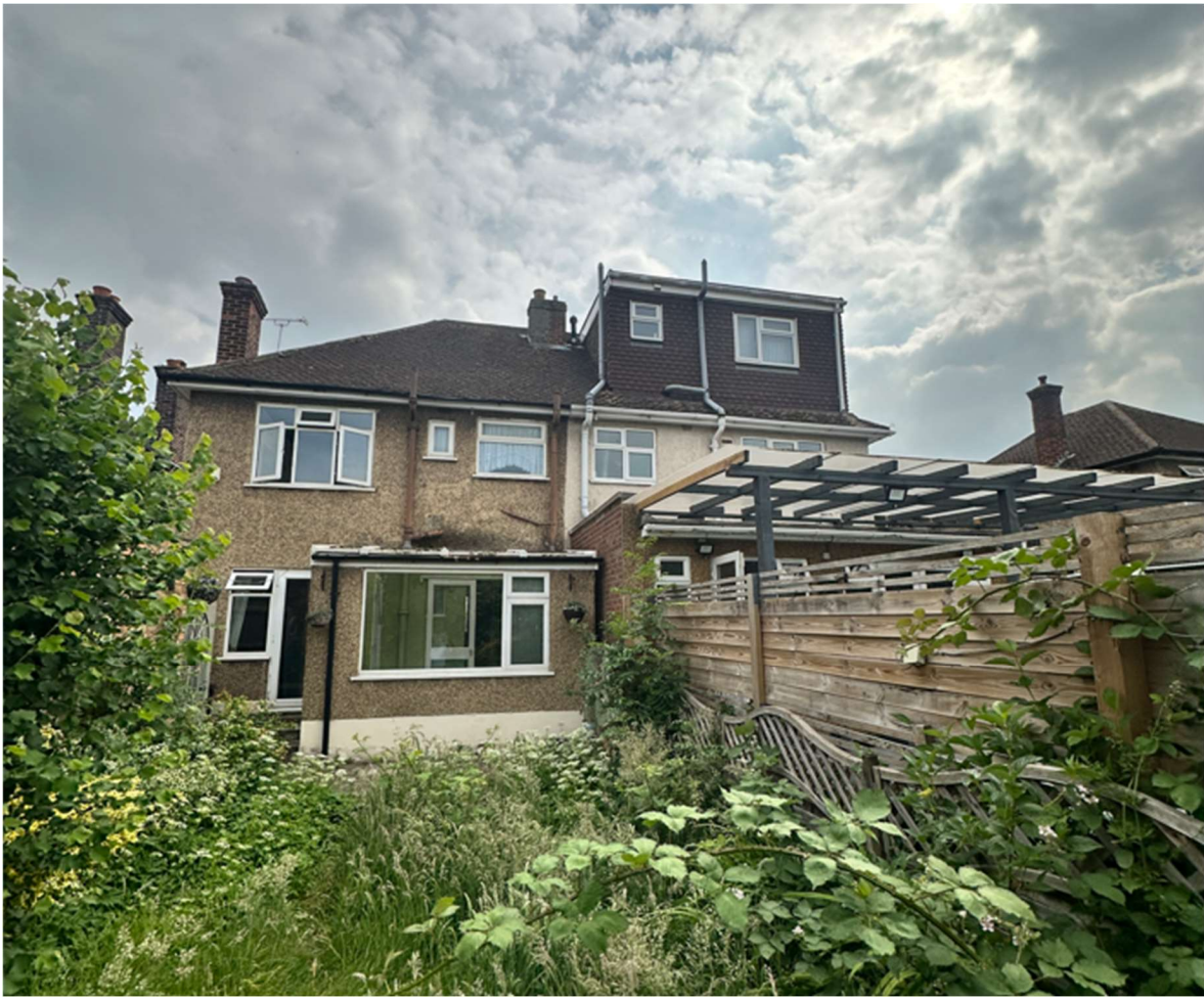
Rear Photo from 10 Sipson Lane