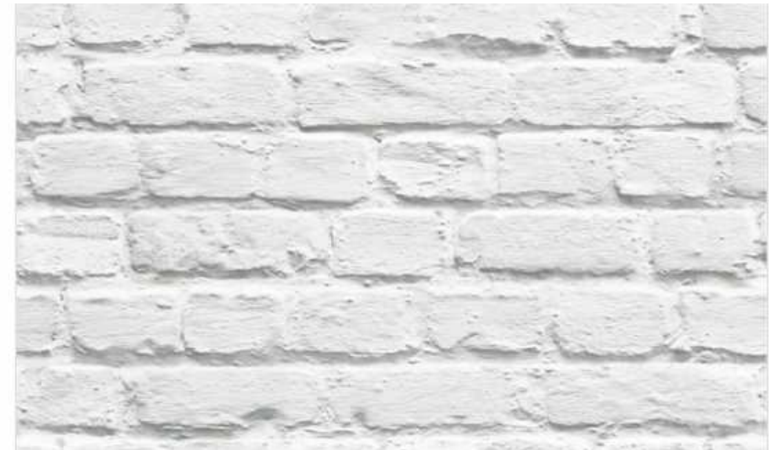
proposed rear matching white washed brickwork

✓ In stock now Delivery in 5 working days