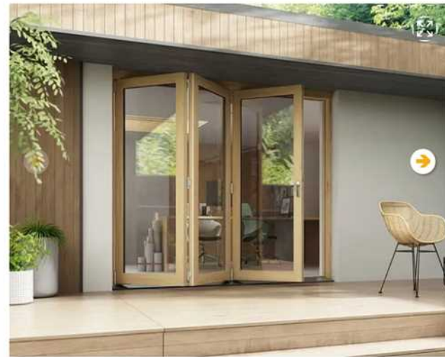
proposed rear bi-fold timber doors

External Doors | Internal Doors | Accessories | Showroom | 0 - £0.00