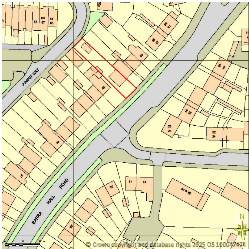
LOCATION MAP (1:1250)