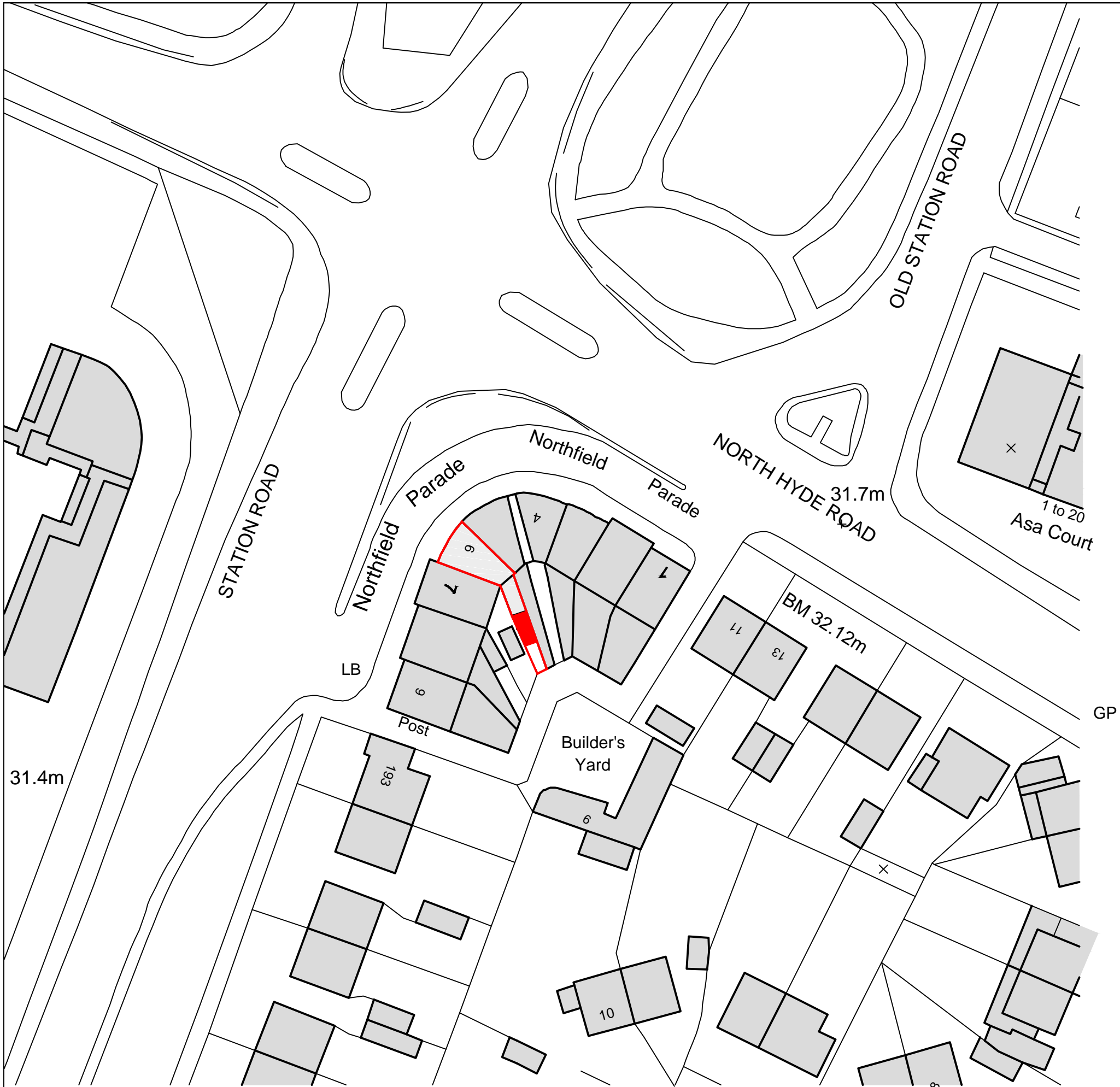
Proposed Block Plan Scale:1:500