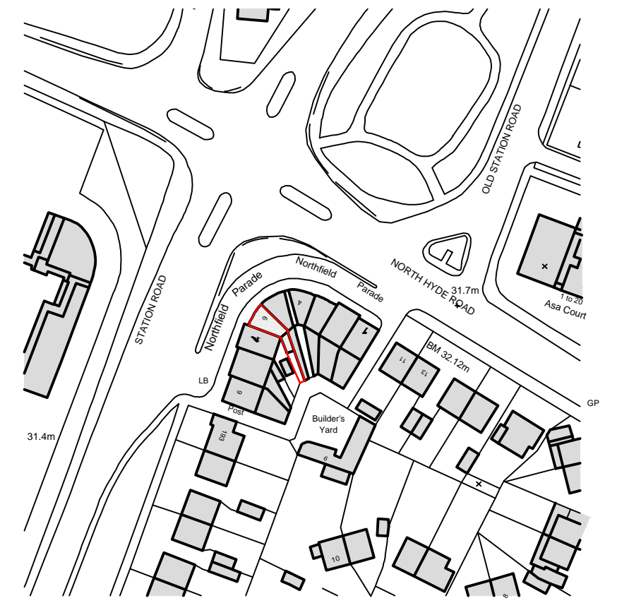
Location Plan Scale:1:500