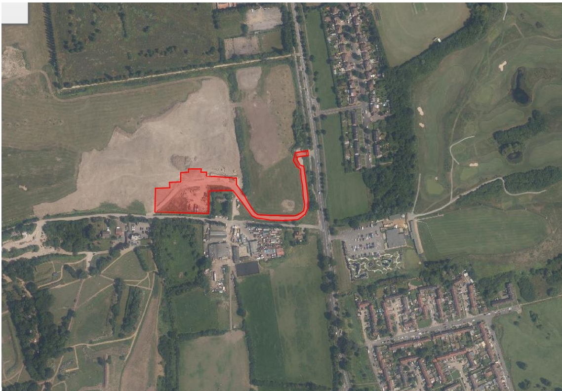
Aerial Photograph – application site shaded red