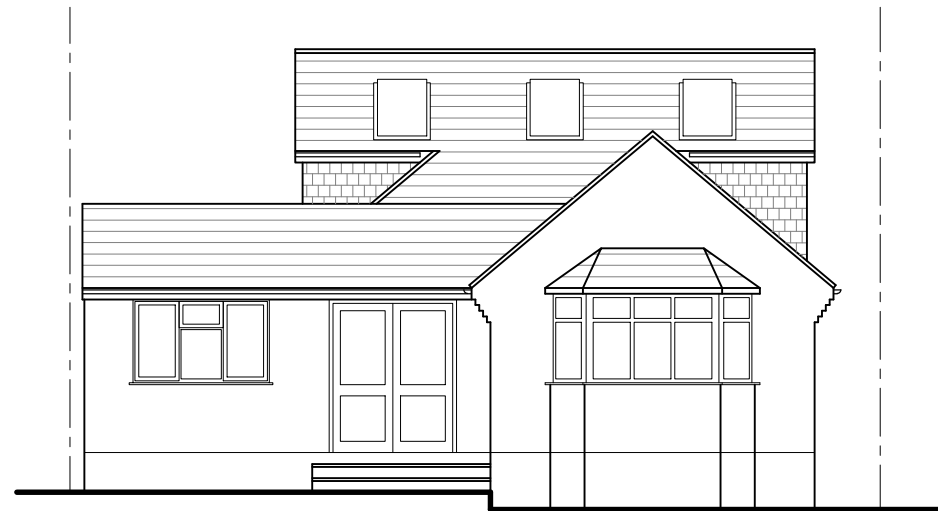
proposed front elevation