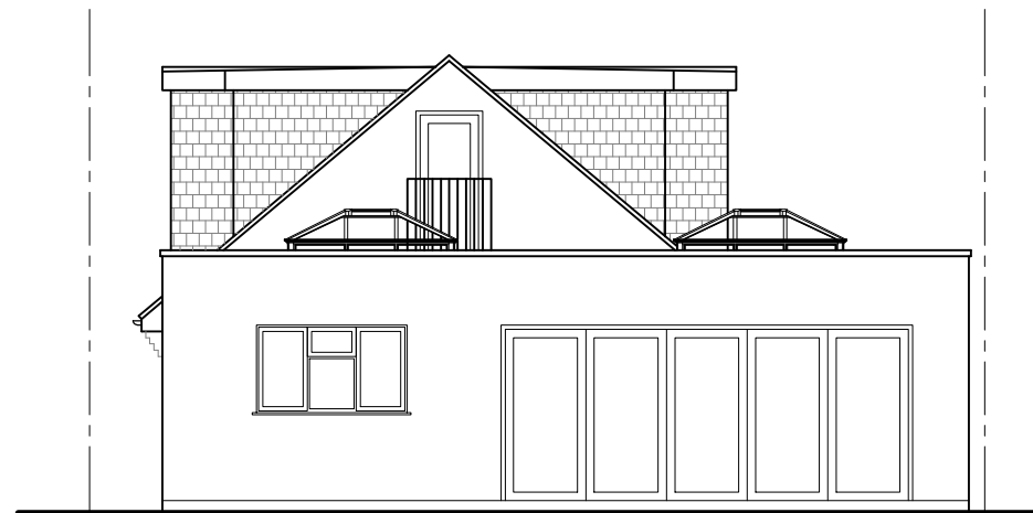
proposed rear elevation