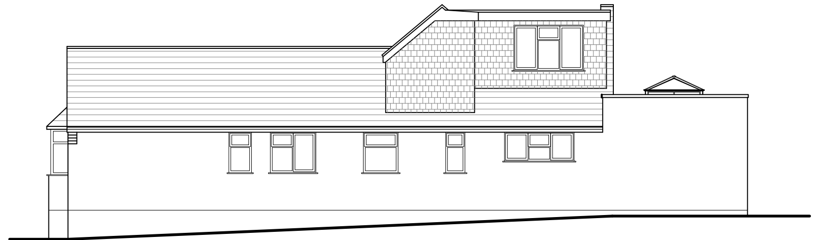
proposed side elevation