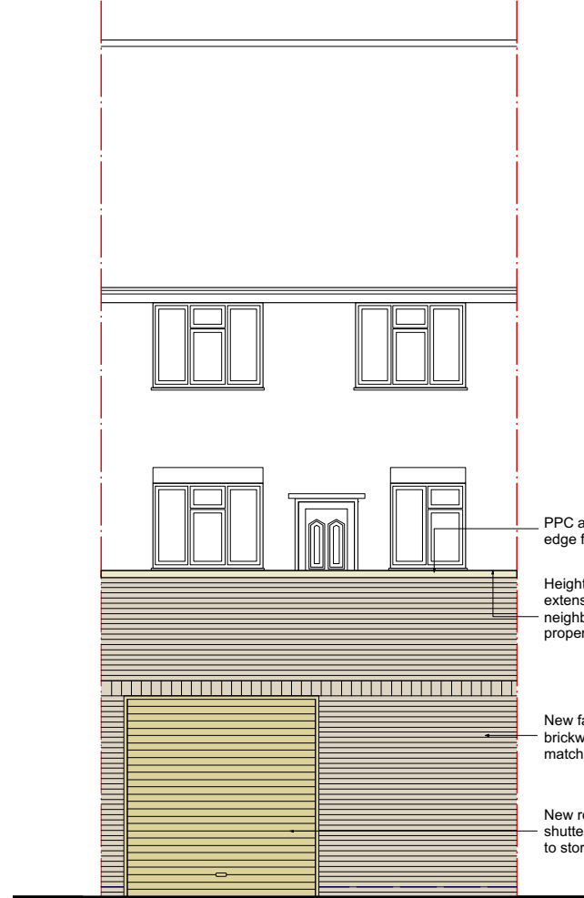
02 PROPOSED REAR ELEVATION A-L-100B 1:100 @ A3