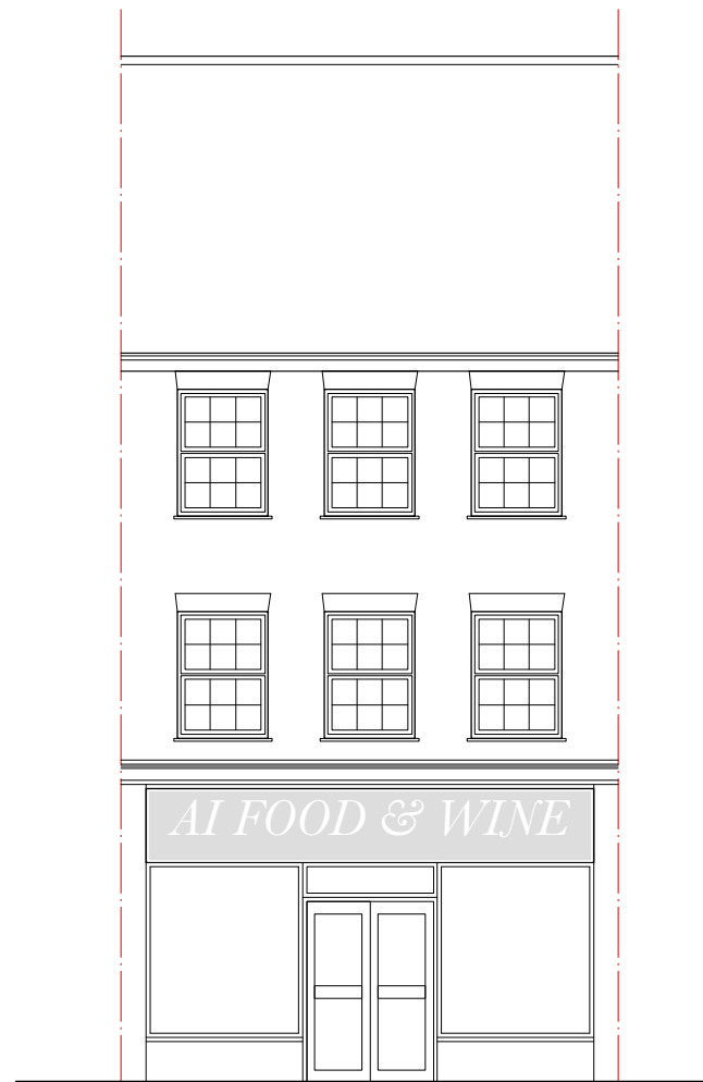
01 PROPOSED FRONT ELEVATION A-L-100B 1:100 @ A3