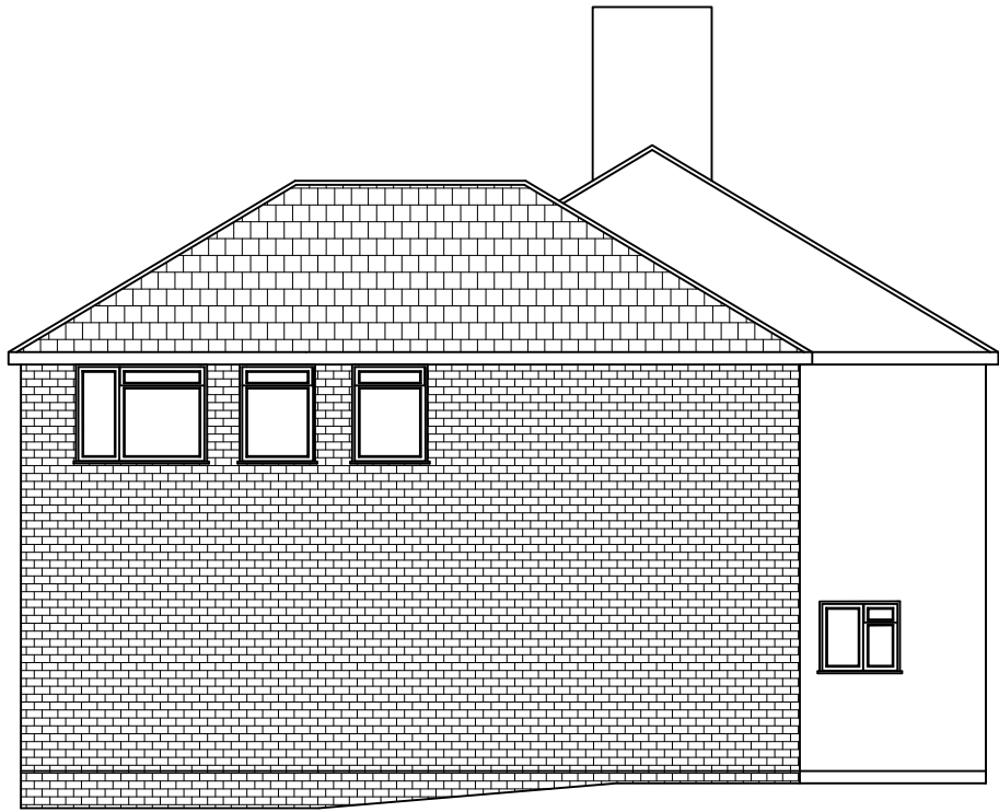
3 Proposed Side Elevation SCALE: 1:100