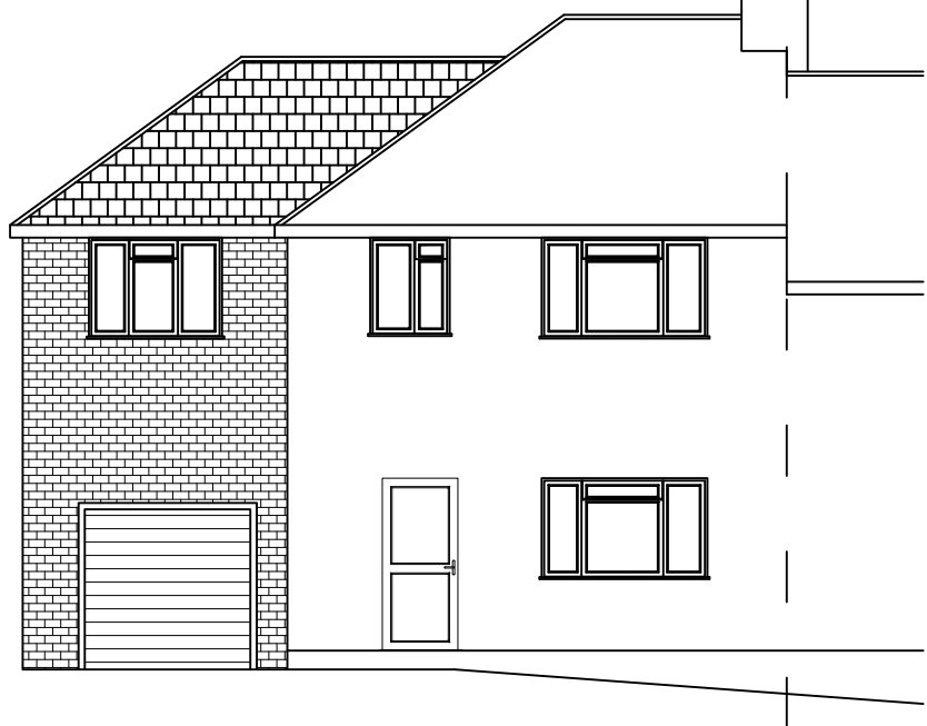
1 Proposed Front Elevation SCALE: 1:100