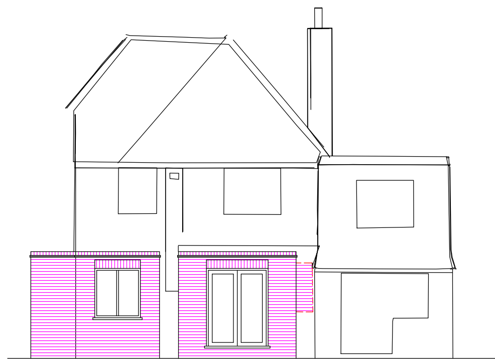
REAR ELEVATION (NORTH WEST)