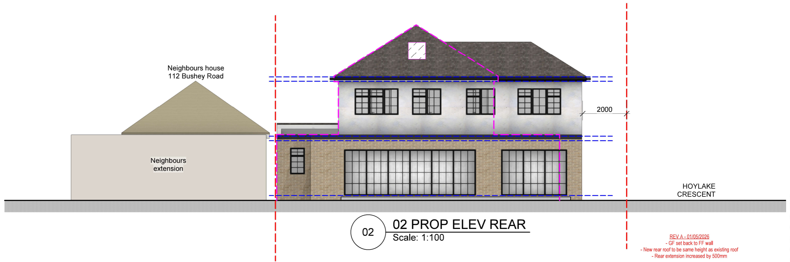
02 02 PROP ELEV REAR Scale: 1:100

REV A - 01/05/2026 - GF set back to FF wall - New rear roof to be same height as existing roof - Rear extension increased by 500mm