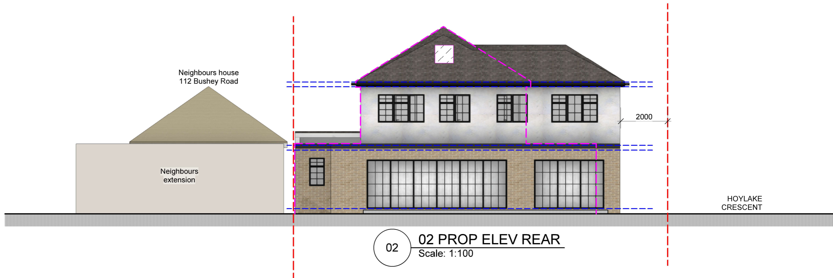
02 02 PROP ELEV REAR Scale: 1:100