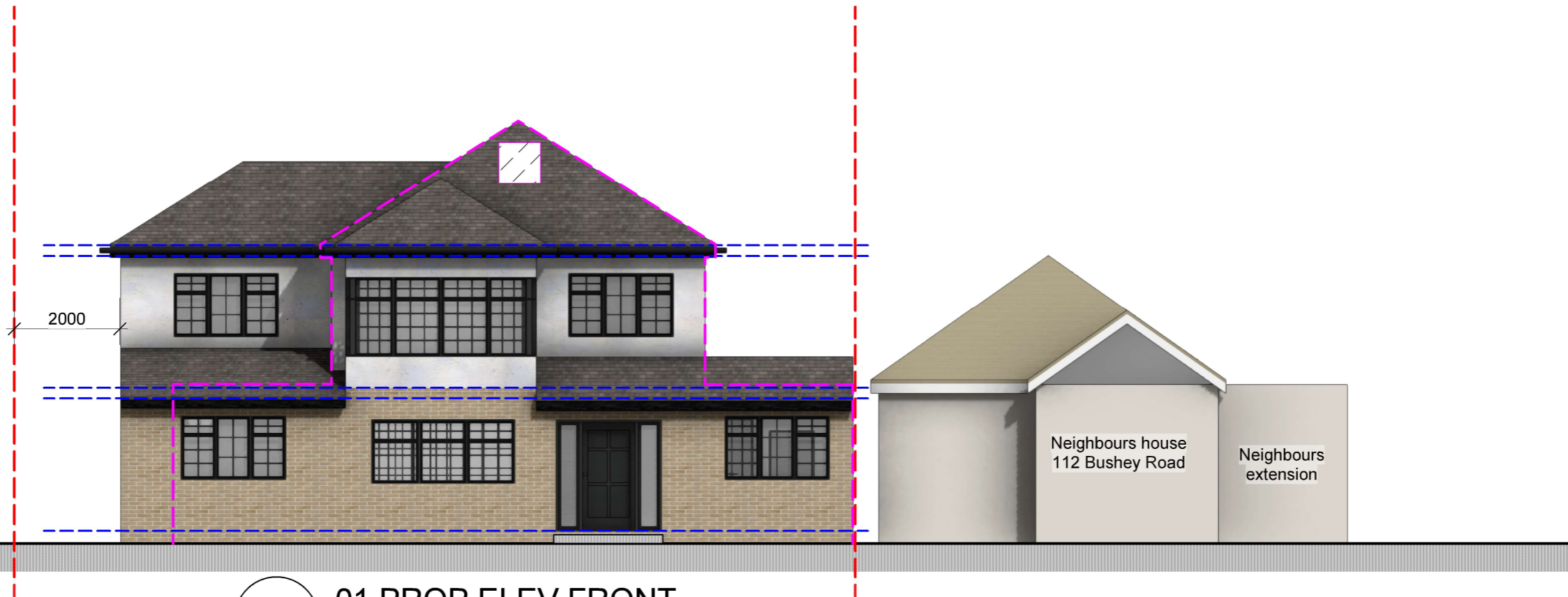
01 01 PROP ELEV FRONT Scale: 1:100