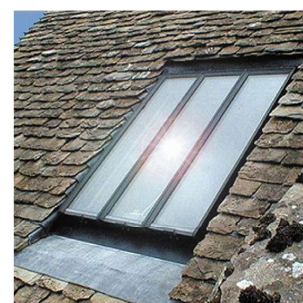
ROOF LIGHTS Conservation style rooflight "the rooflight company" or similar. To be flush with flat roof and hidden by parapet.