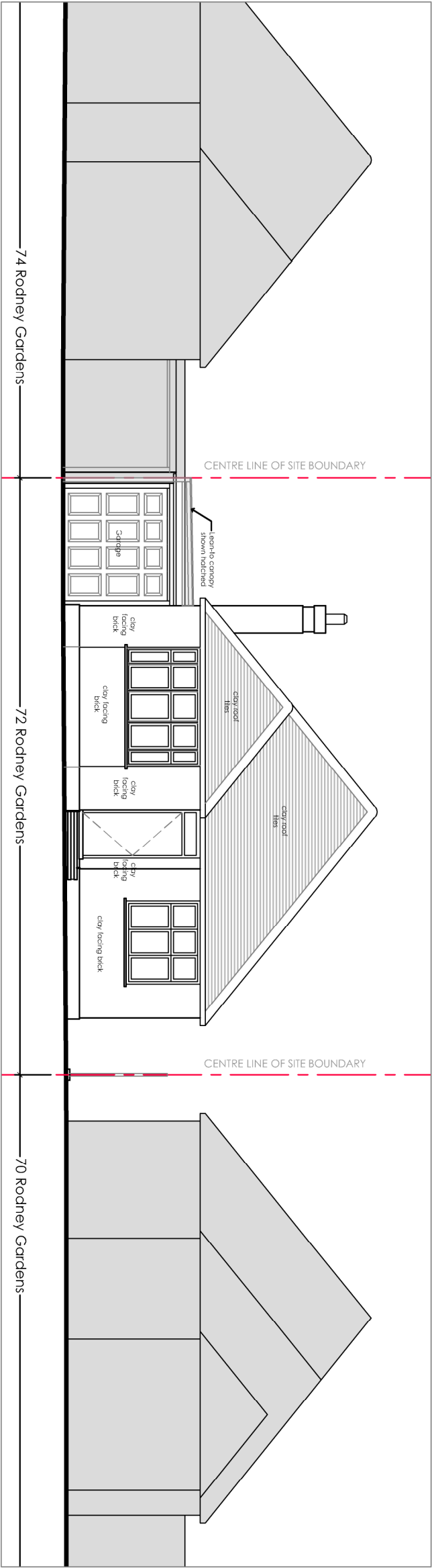
EXISTING ELEVATION NORTH