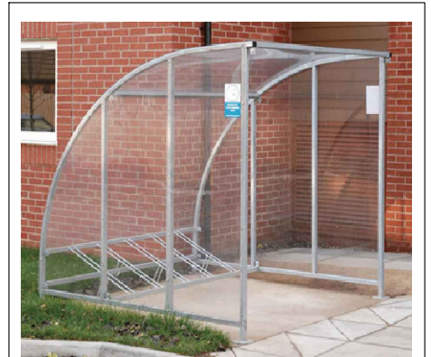
Cycle Shelter. Proposed covered cycle shelter for five cycles 2030mm wide x 2143mm deep x 2100mm high.