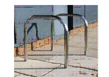
Sheffield Cycle Hoop. Proposed one Sheffield cycle hoop for two cycles.