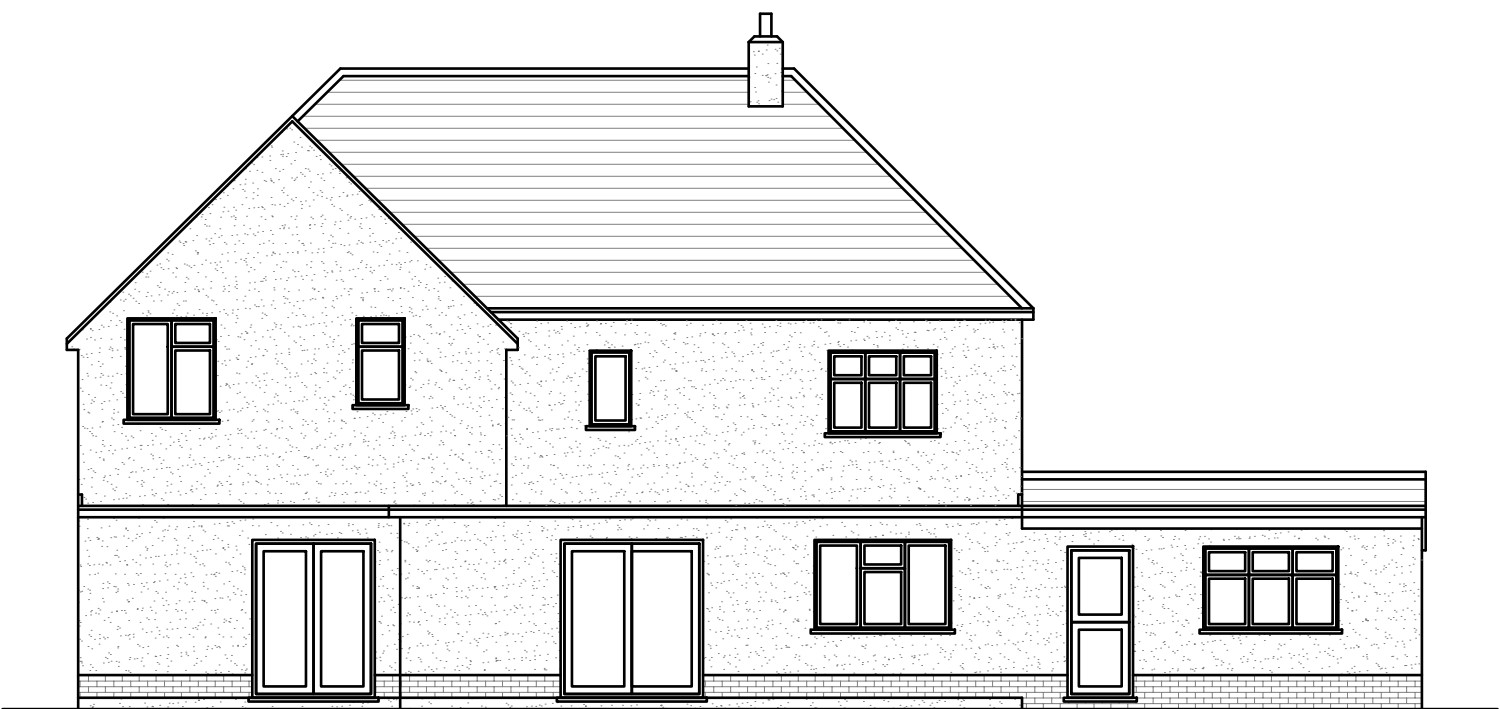
Existing Rear Elevation Scale 1:100