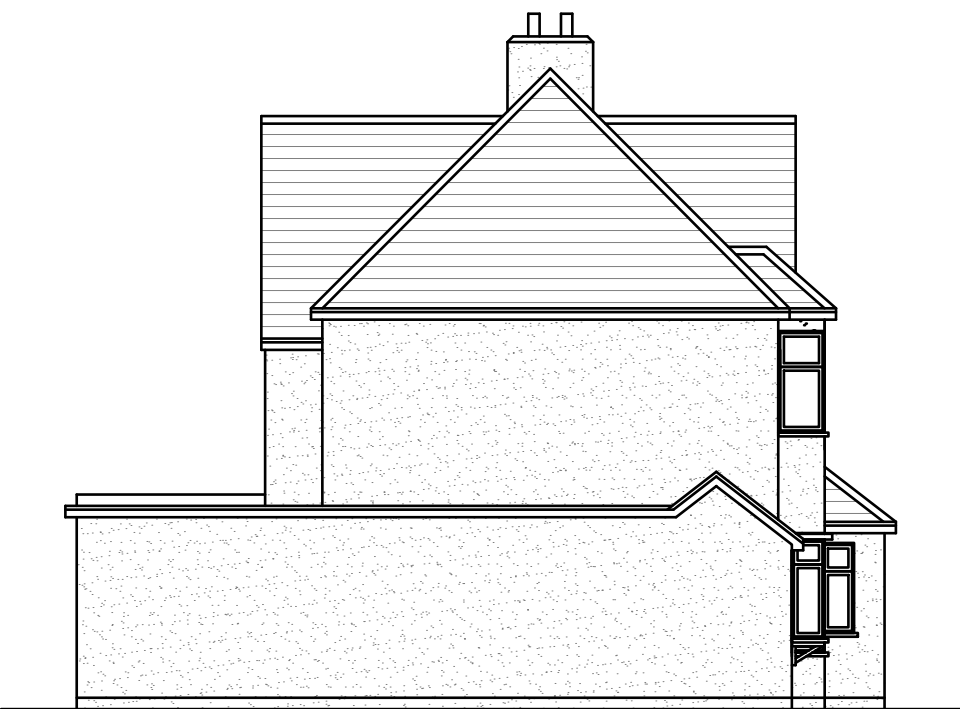
Existing Side Elevation Scale 1:100