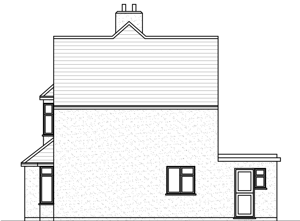
Existing Side Elevation Scale 1:100