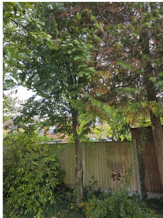
Image 2 T04 a small plum tree on the rear boundary.