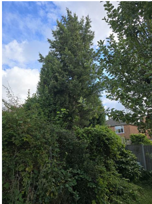
Image 4 T06 an Italian cypress tree in the adjacent property.