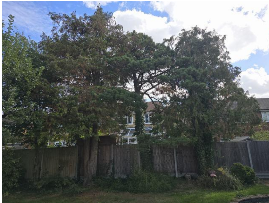
Image 1 T01 to T04 across the rear boundary.