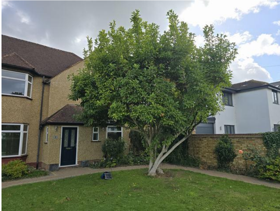
Image 5 T07 a multi stemmed magnolia tree in the front garden.