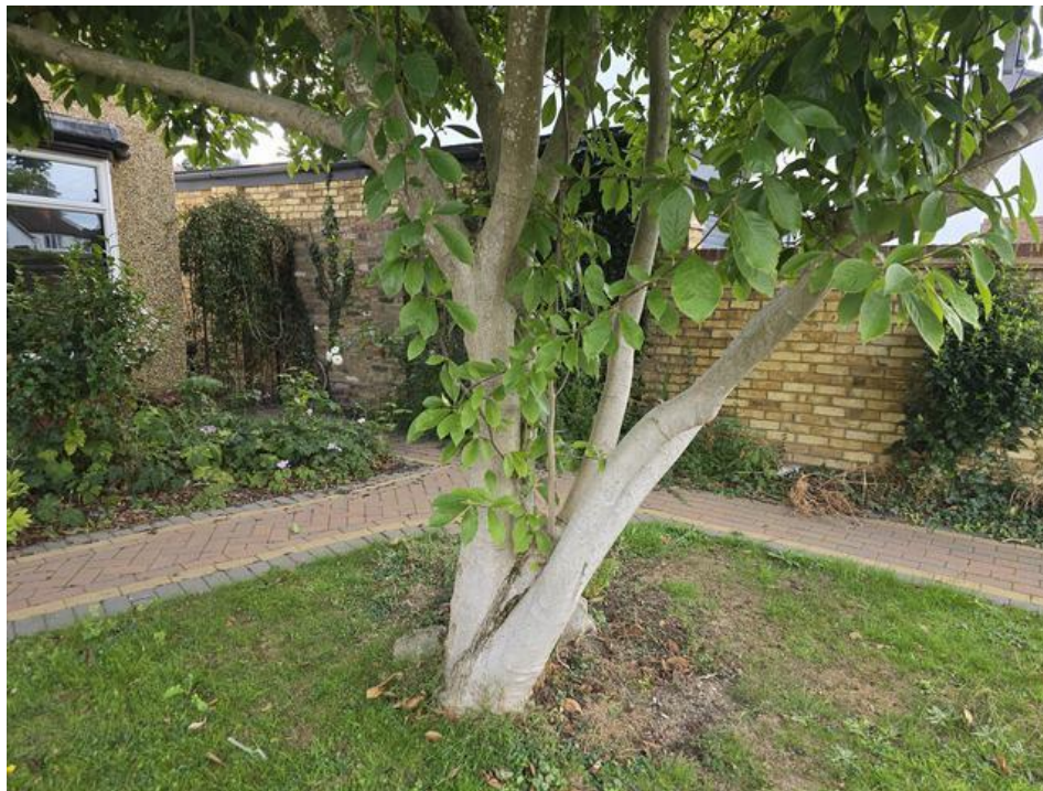
Image 6 Poor form and structure on the magnolia tree T07.