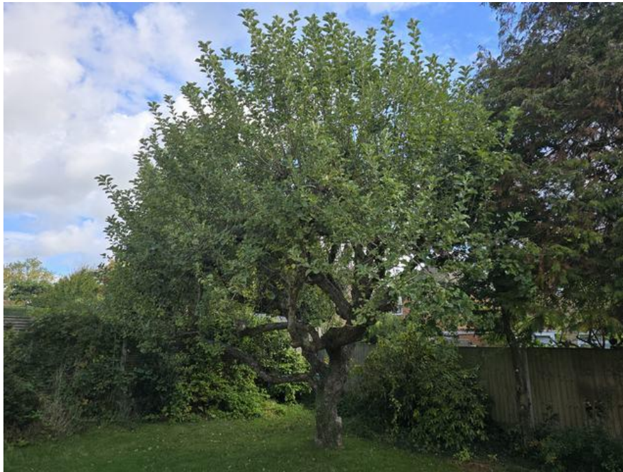
Image 3 T05 an aging apple tree in the centre of the back lawn.