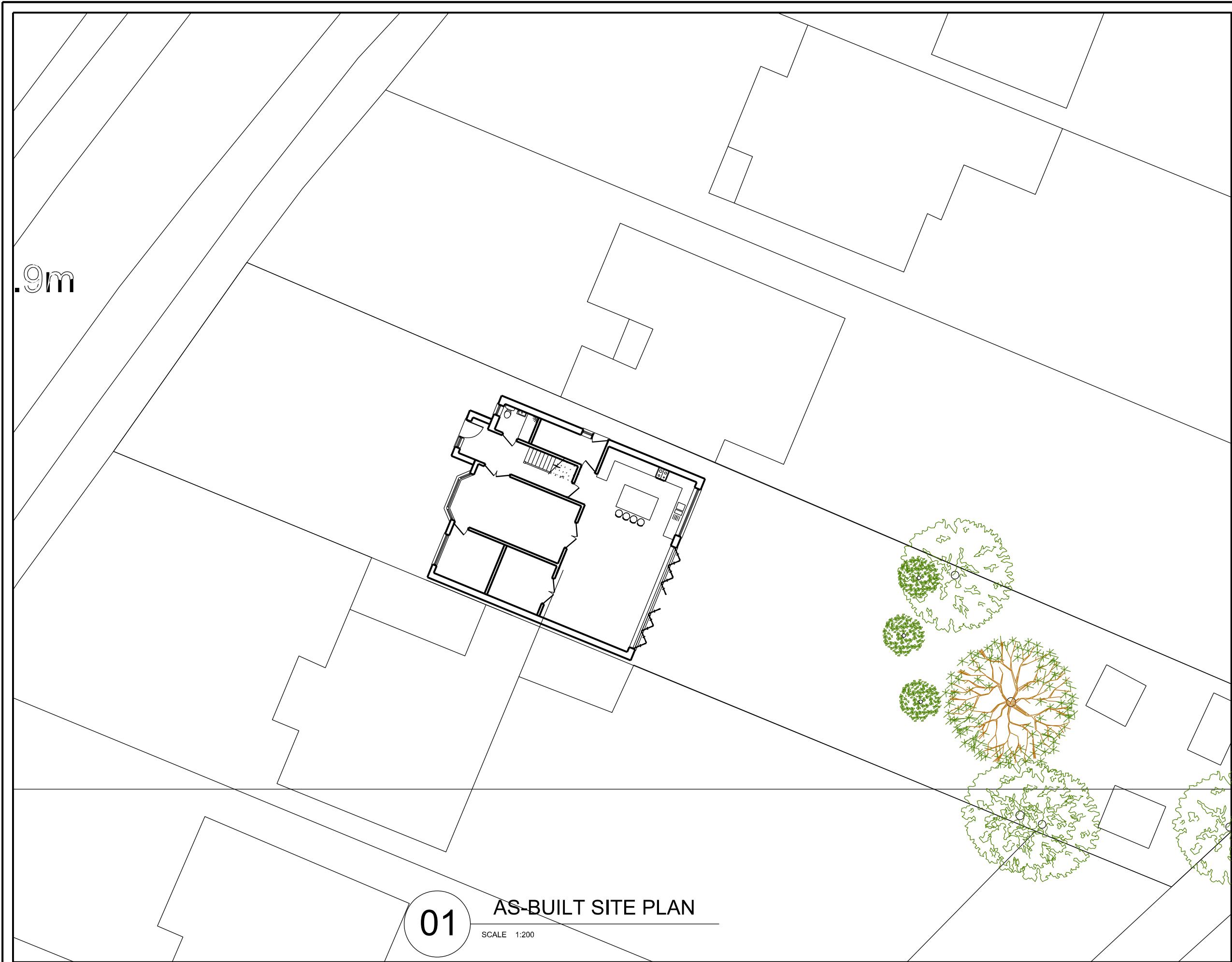
01 AS-BUILT SITE PLAN SCALE 1:200