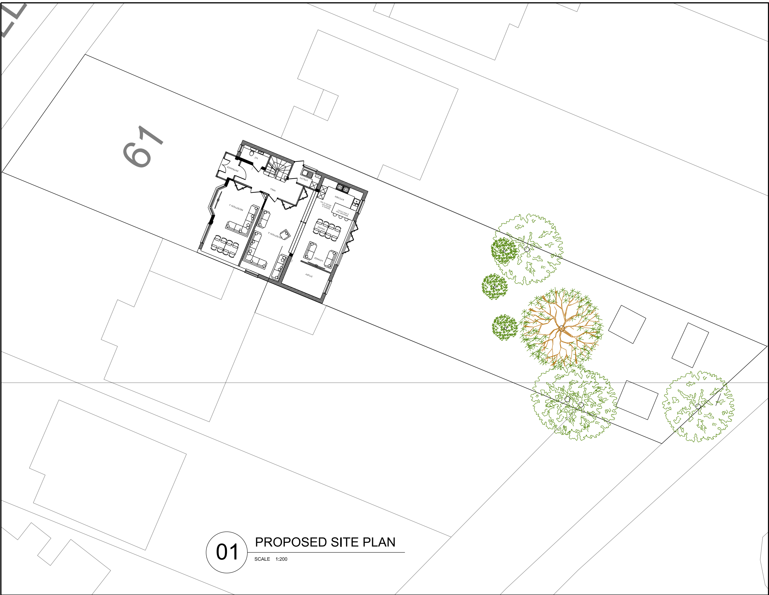
01 PROPOSED SITE PLAN SCALE 1:200