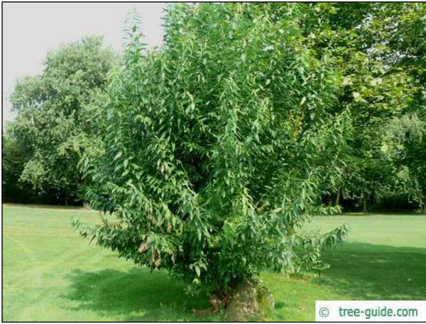
Example photo of a Crack Willow