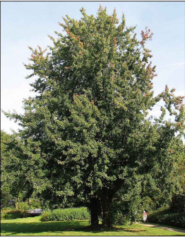
Example photo of a Silver Maple

Manufacturer: Contractor's choice. Product reference: Contractor's choice. Type: Round. Material: Polyethylene. Size: 0.6 m high x 175 mm diameter. Colour: Green. Support: Single timber stake. General: Ensure that protection methods do not impede natural movement of shrubs or restrict growth.